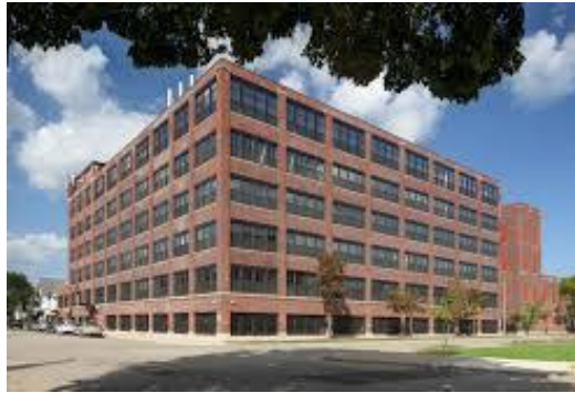
Welford Sanders Historic Lofts