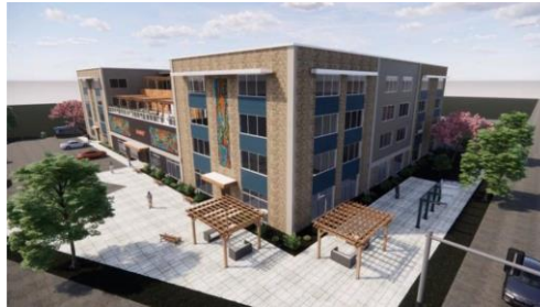
3116 N King Drive (53212)