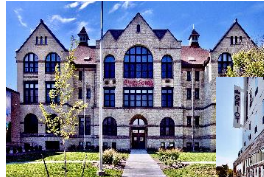
Garfield School Apartments / The Griot