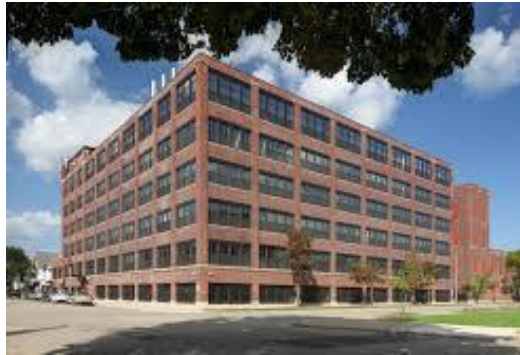
Welford Sanders Historic Lofts