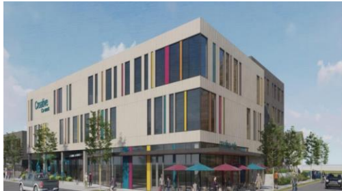
Bronzeville Creative Arts and Technology Hub (53212)