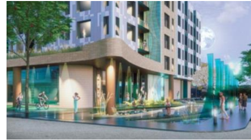
Greenfield Ave. Commons (53204)