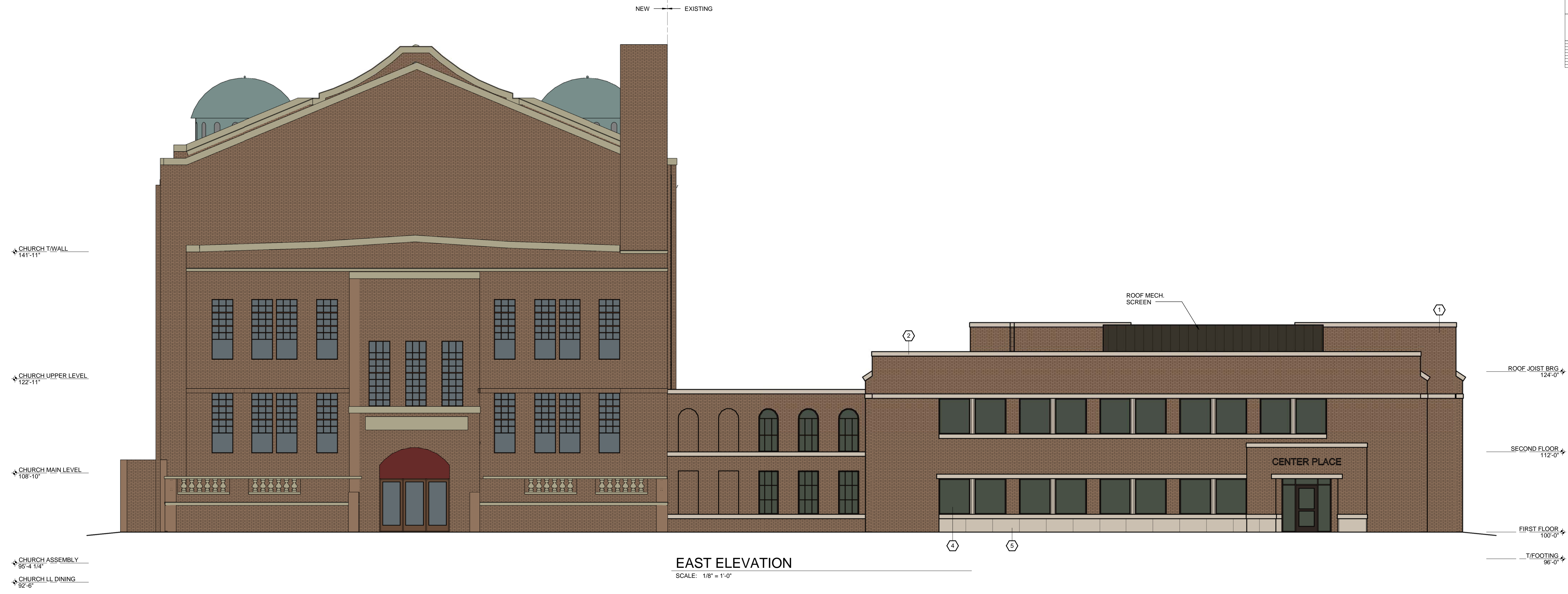
EAST ELEVATION SCALE: 1/8" = 1'-0"