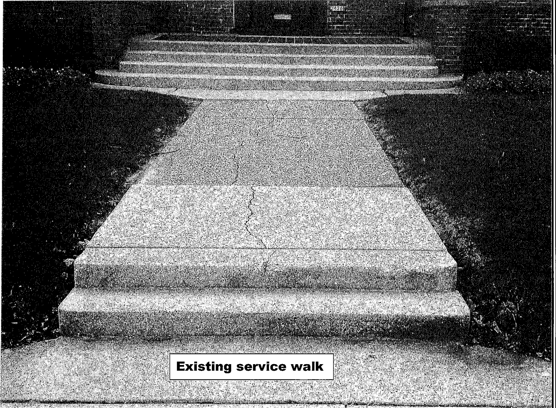
Existing service walk