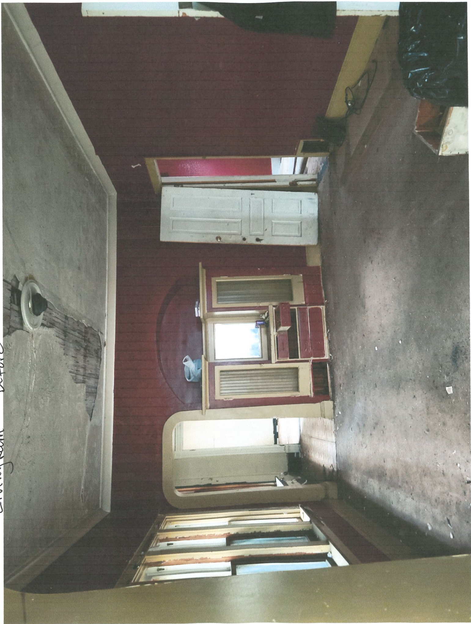
LIVING ROOM Before