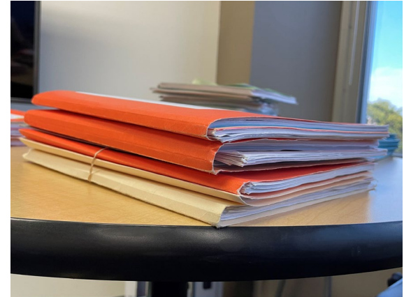
Example of one environmental health record