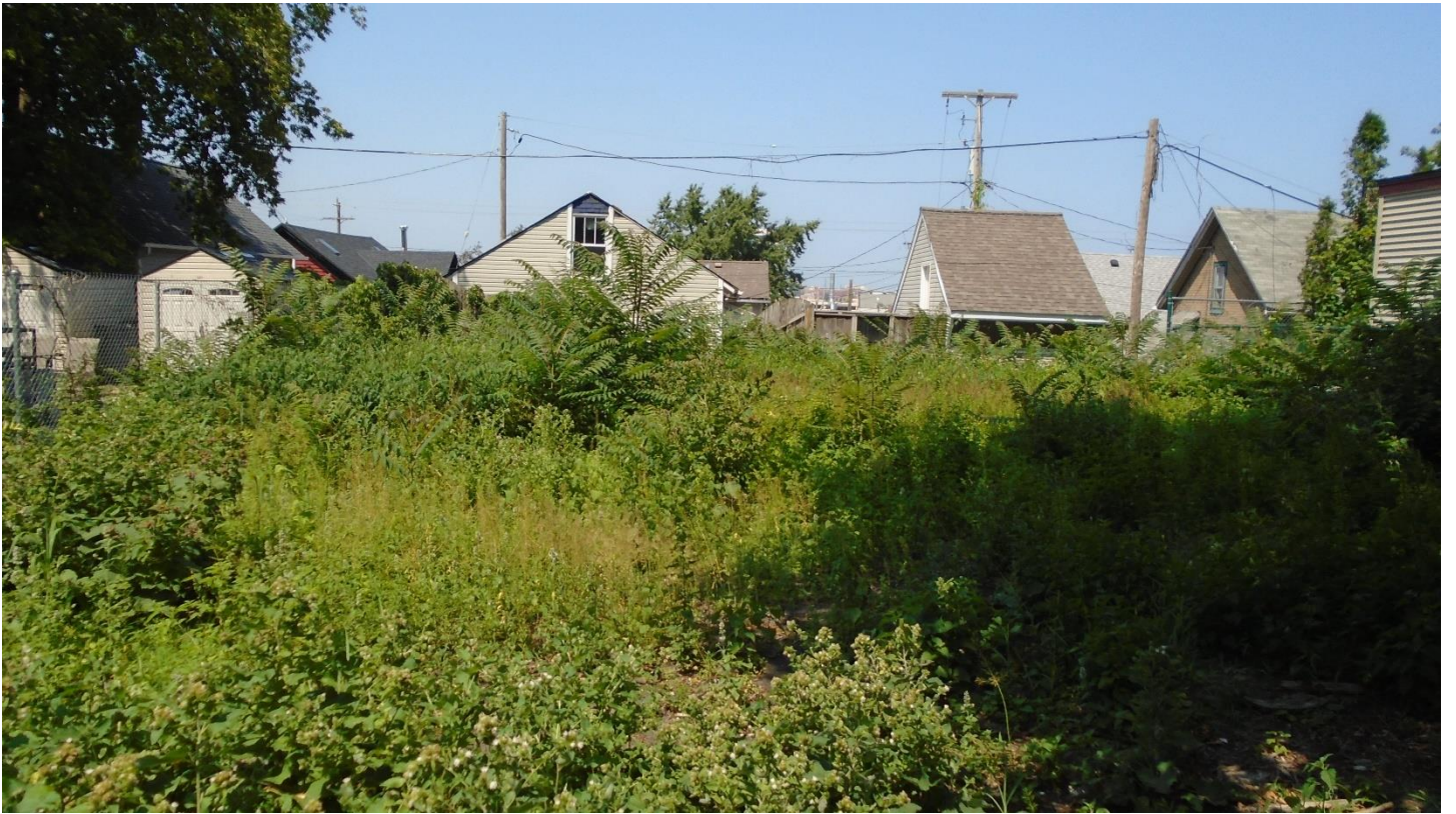
Rear yard looking north