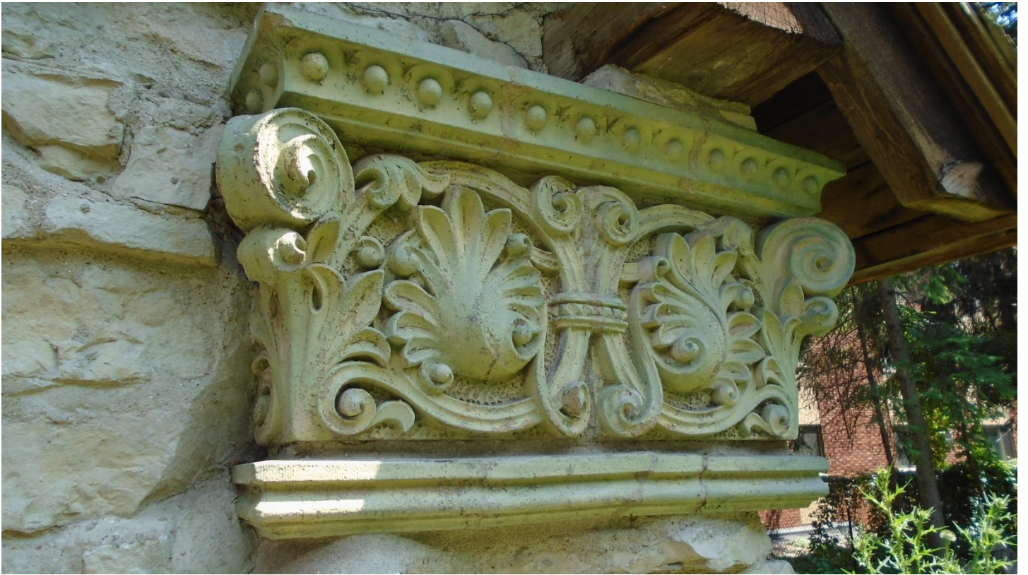
Chapel exterior, capital reused from demolished Milwaukee building