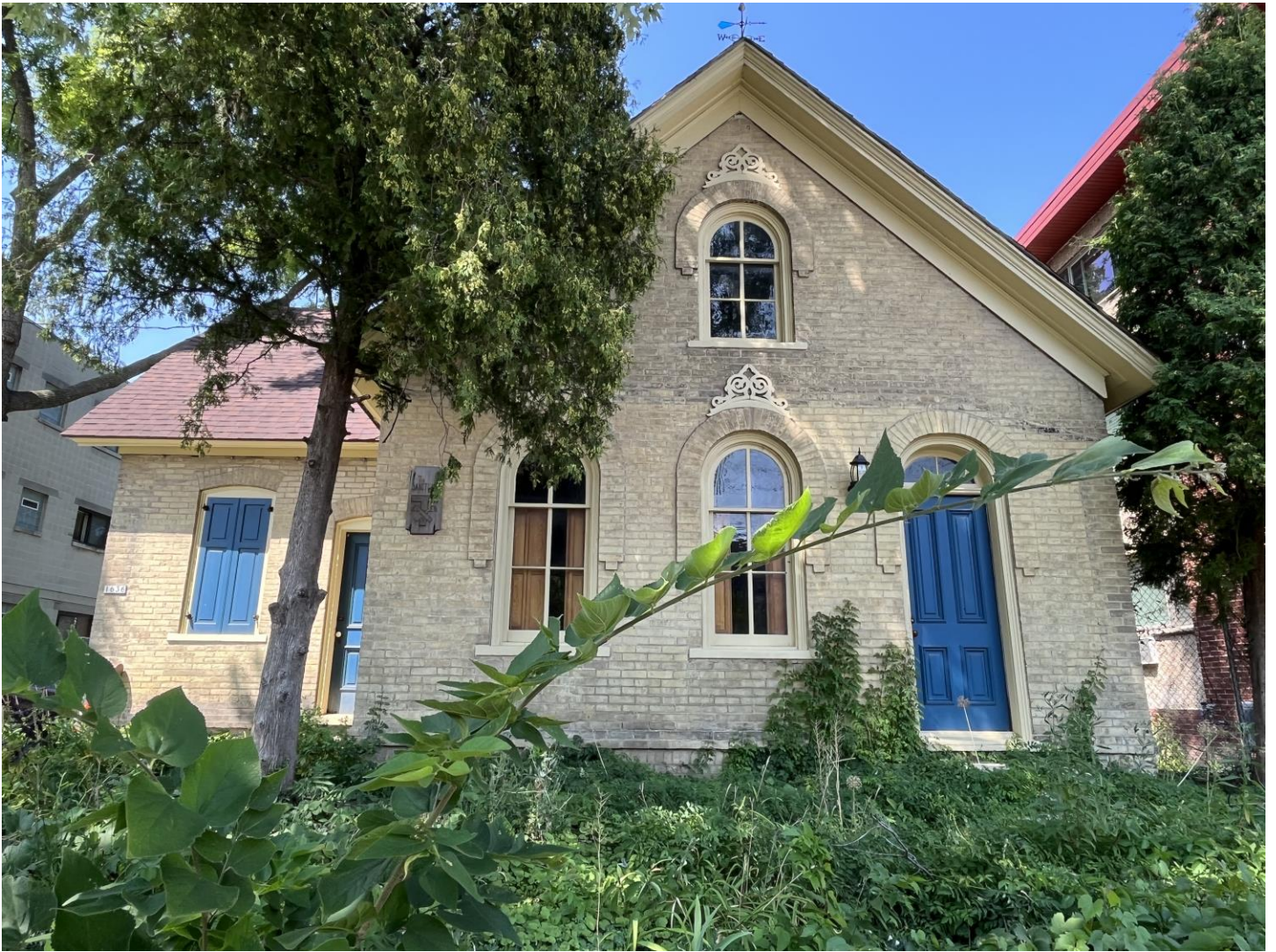
South (main) façade