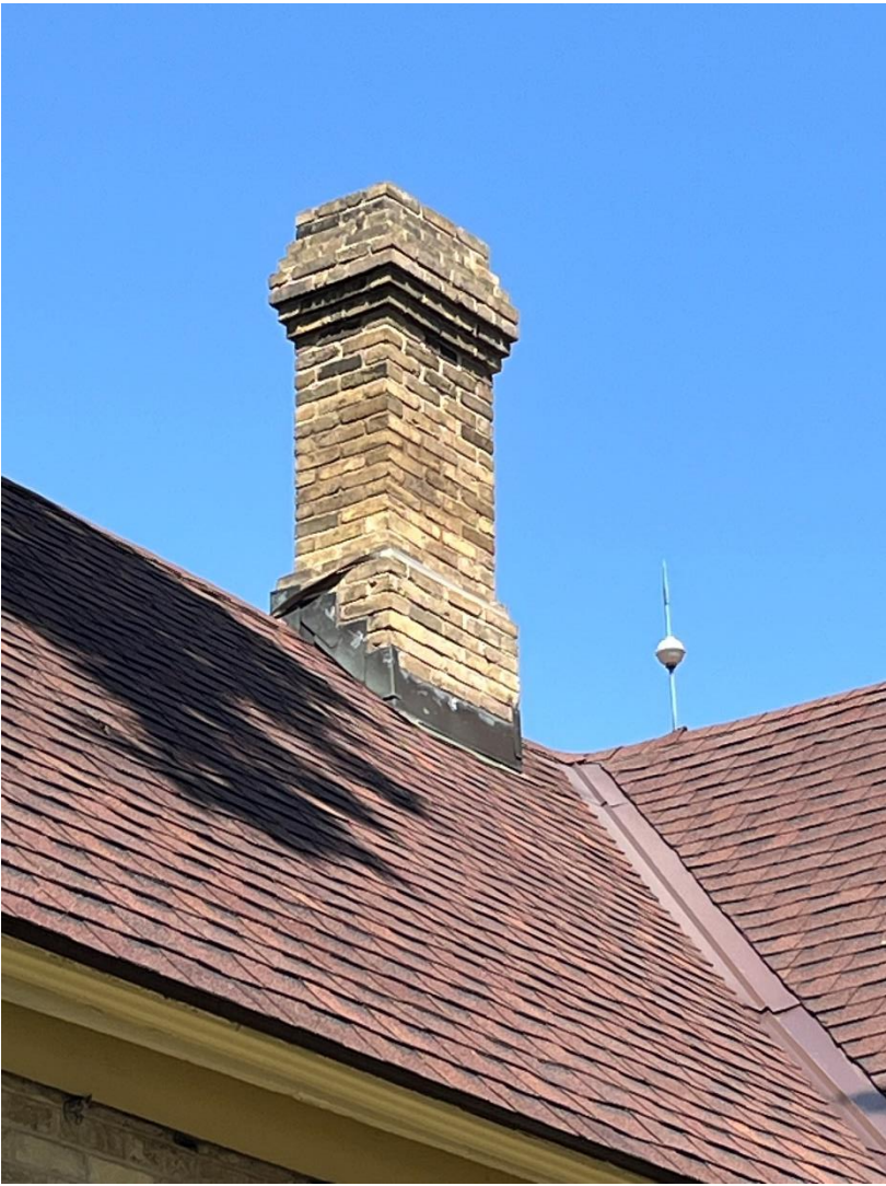
Corbelled chimney close up