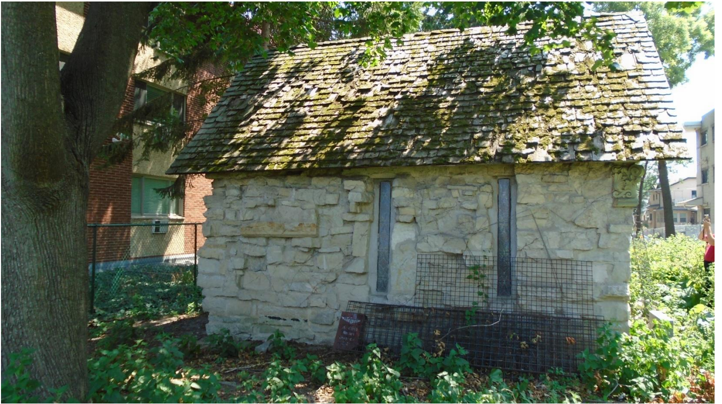
Chapel north façade