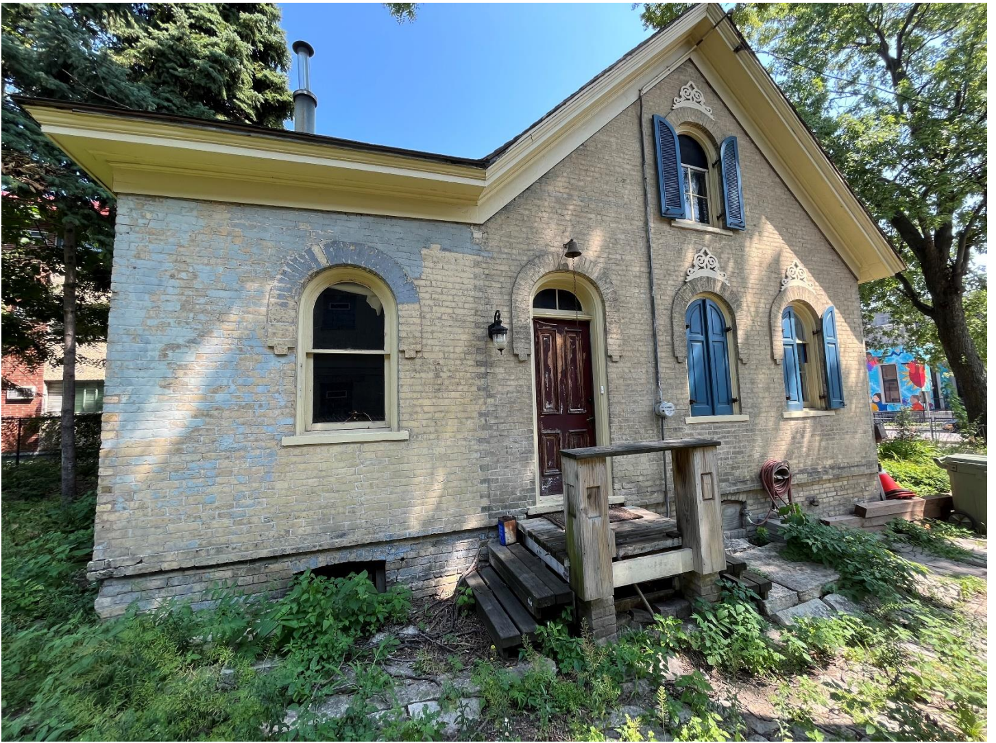
West Façade, 1901 addition evident on left