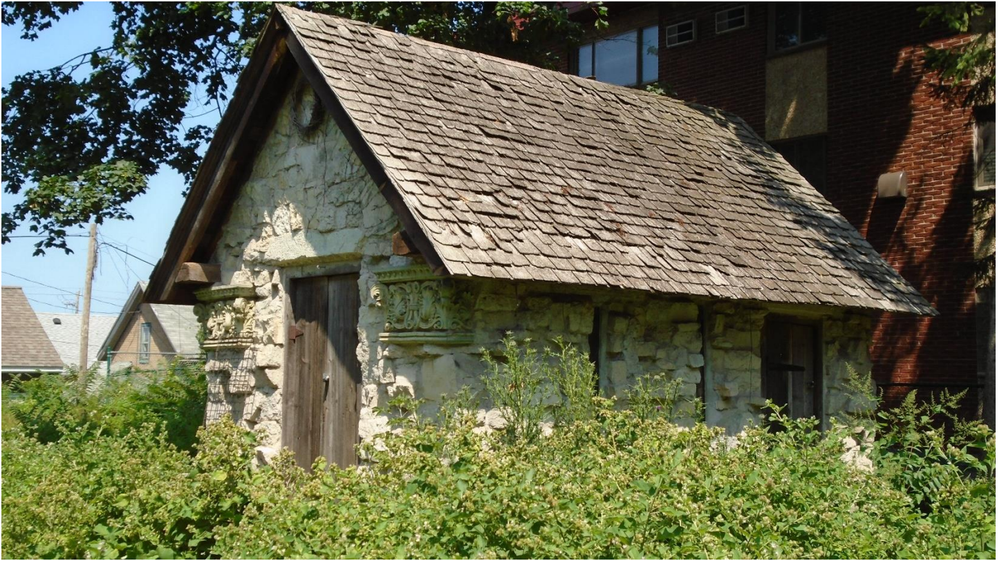
Circa 1983 Chapel