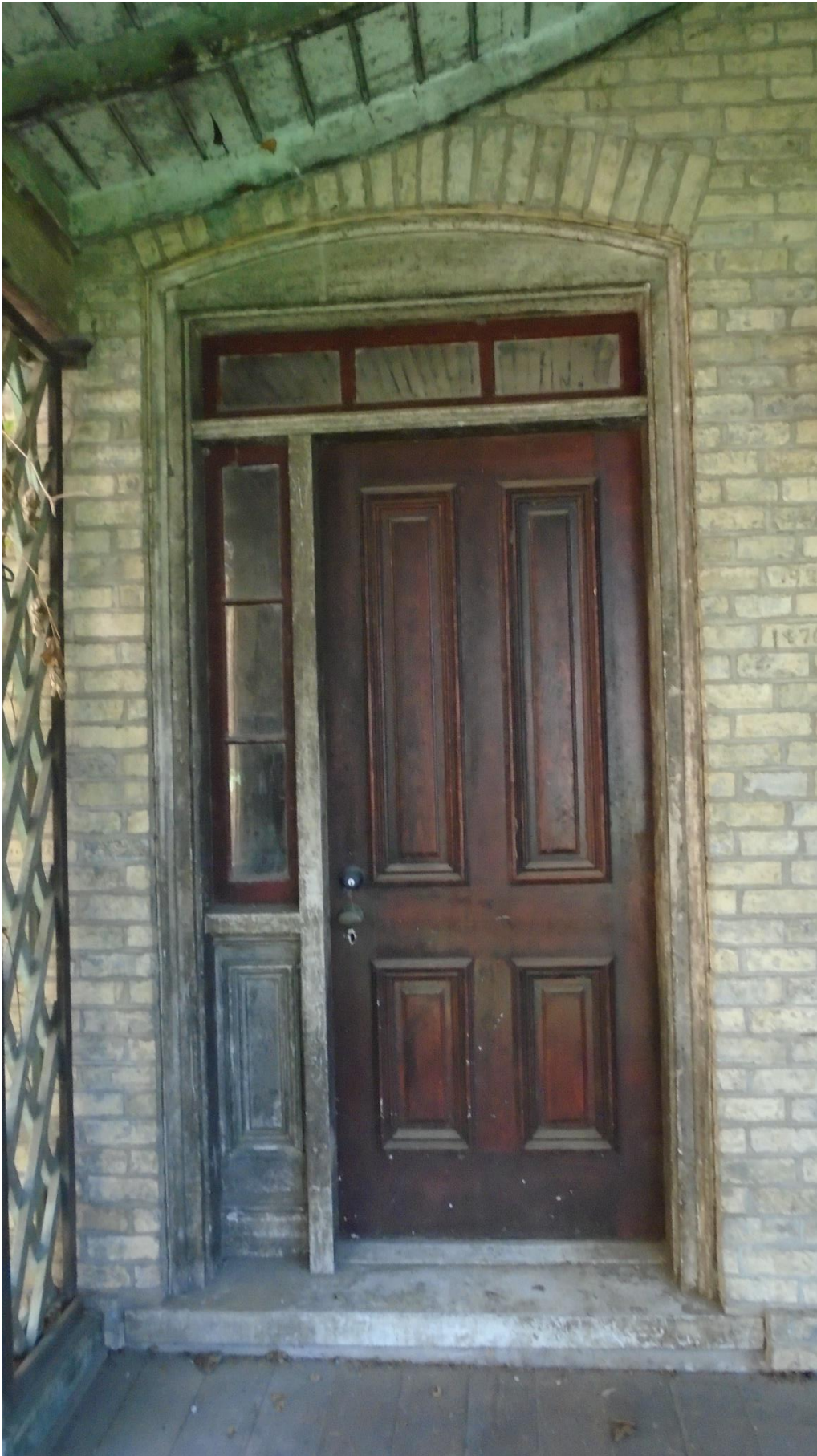
North façade entryway