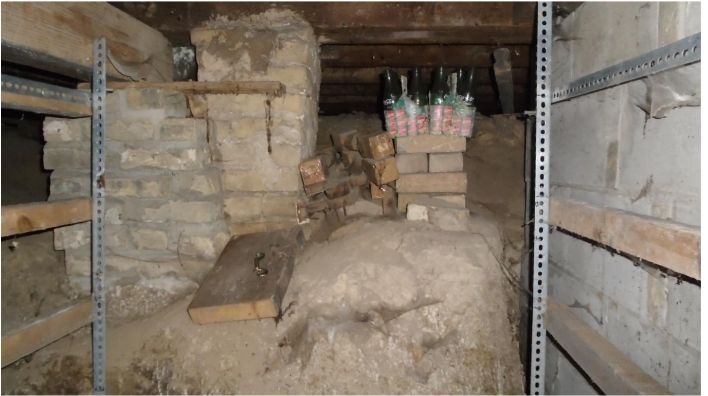
Partially dug basement