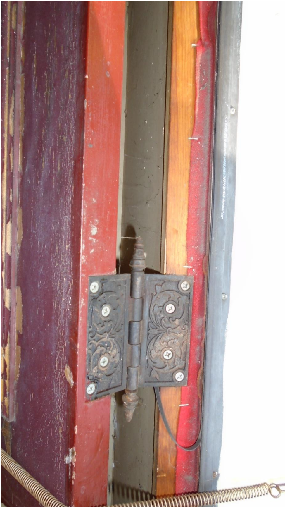
Decorative door hinge