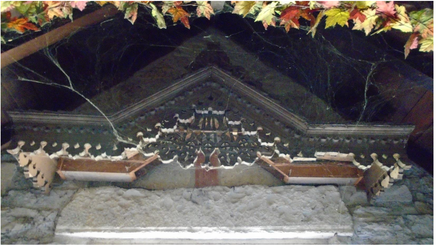
Chapel door lintel detail