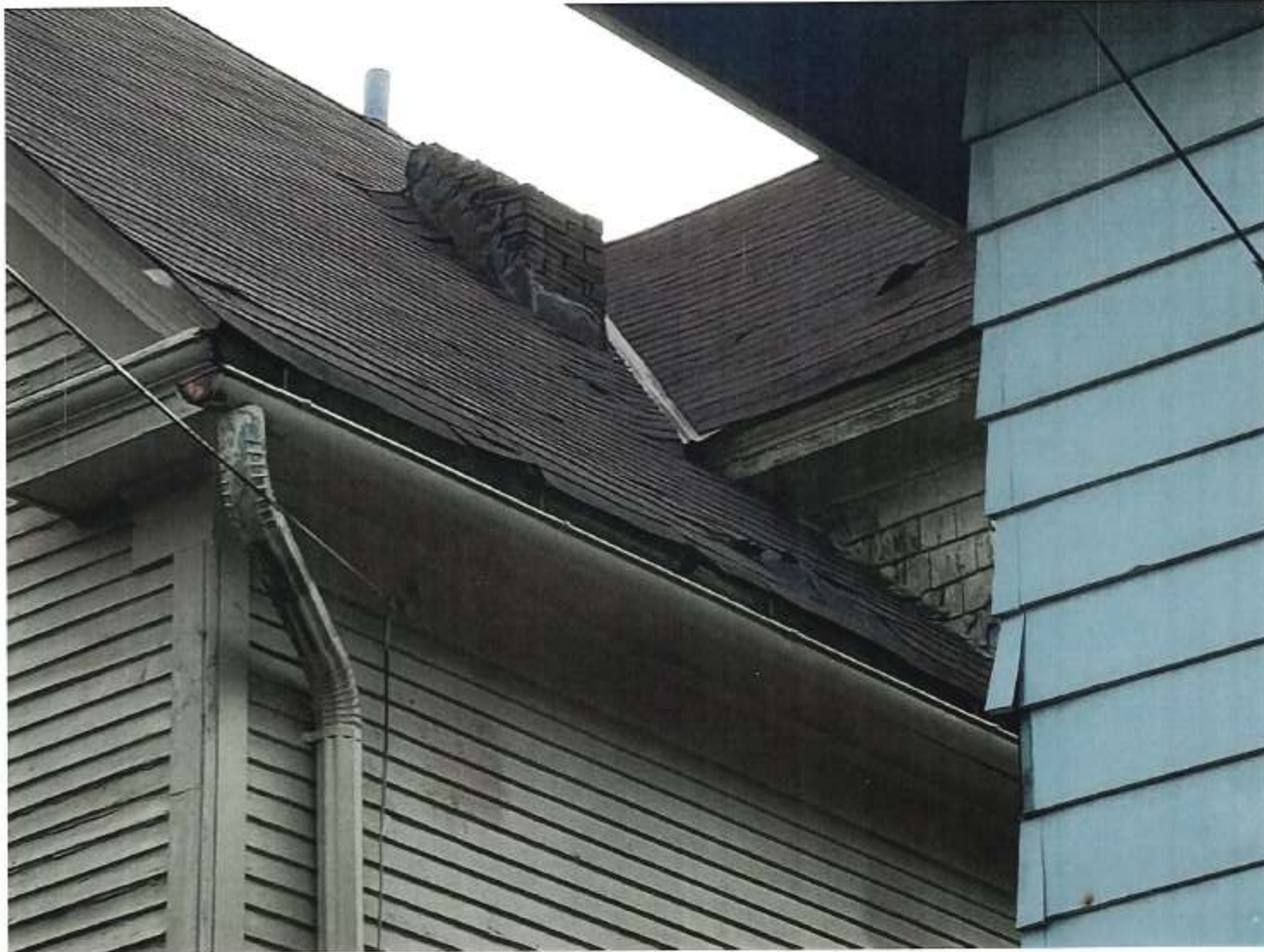
Current view of chimney