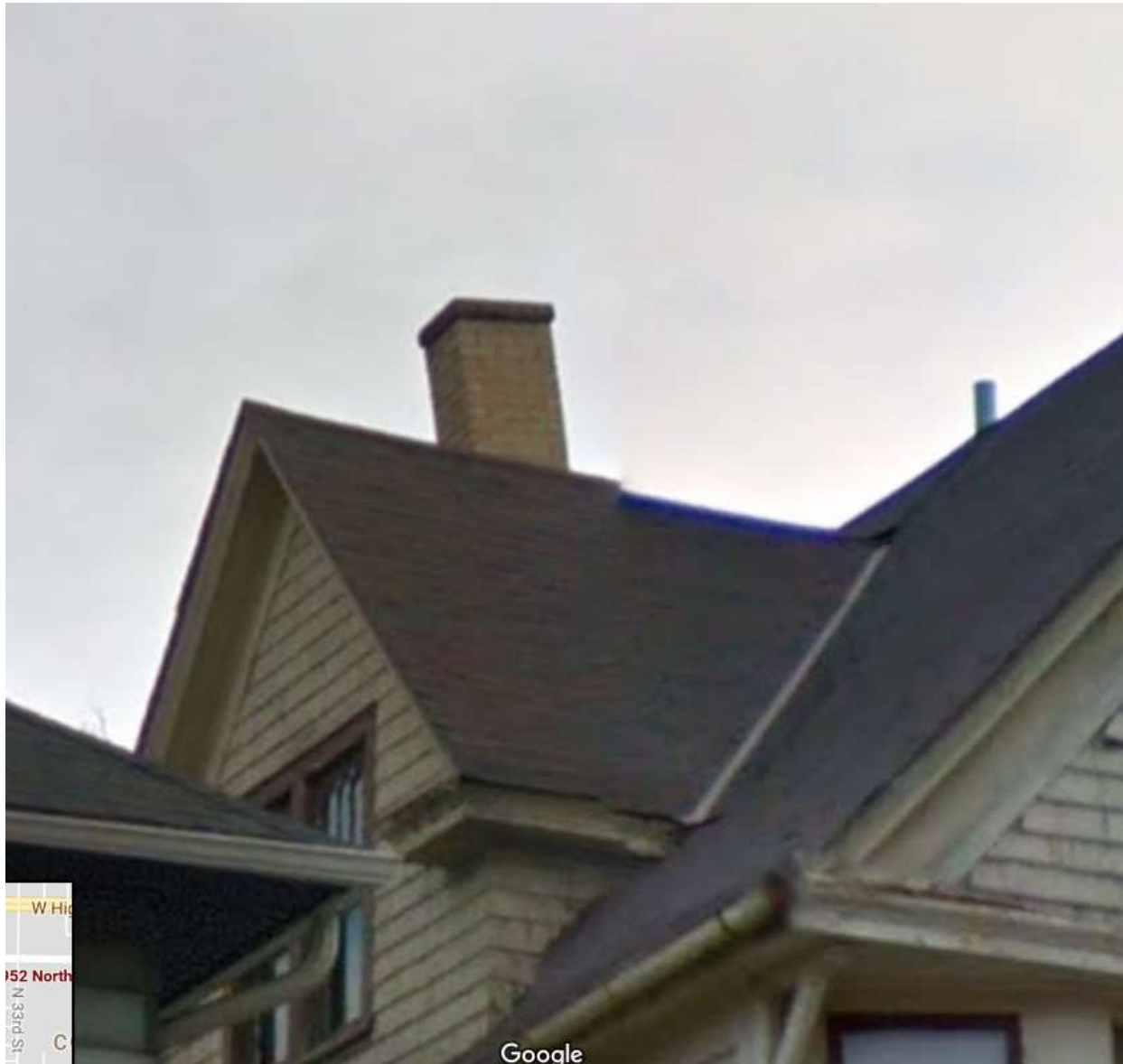
Google chimney closeup, 2015