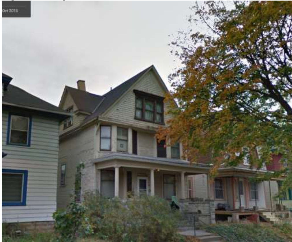
2015 front view