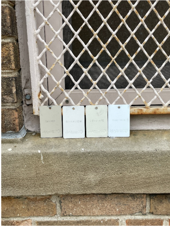
4 selected off-white options leaning against existing window