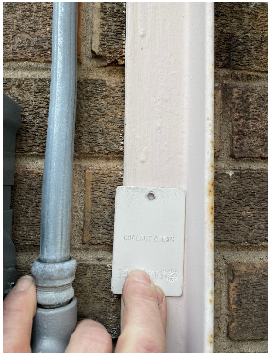
Selected match 'Coconut Cream' from the samples.