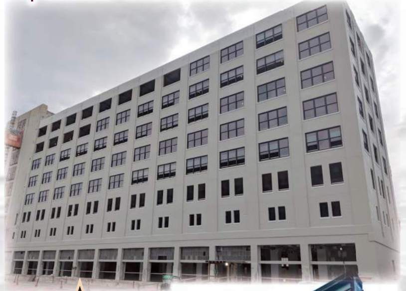
▲ Southern Railways Building Atlanta, GA