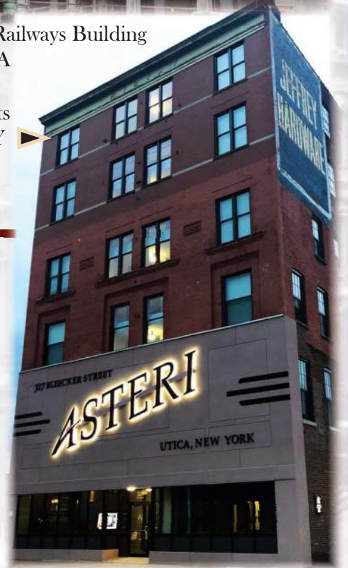
Asteri Apartments Utica, NY ▶