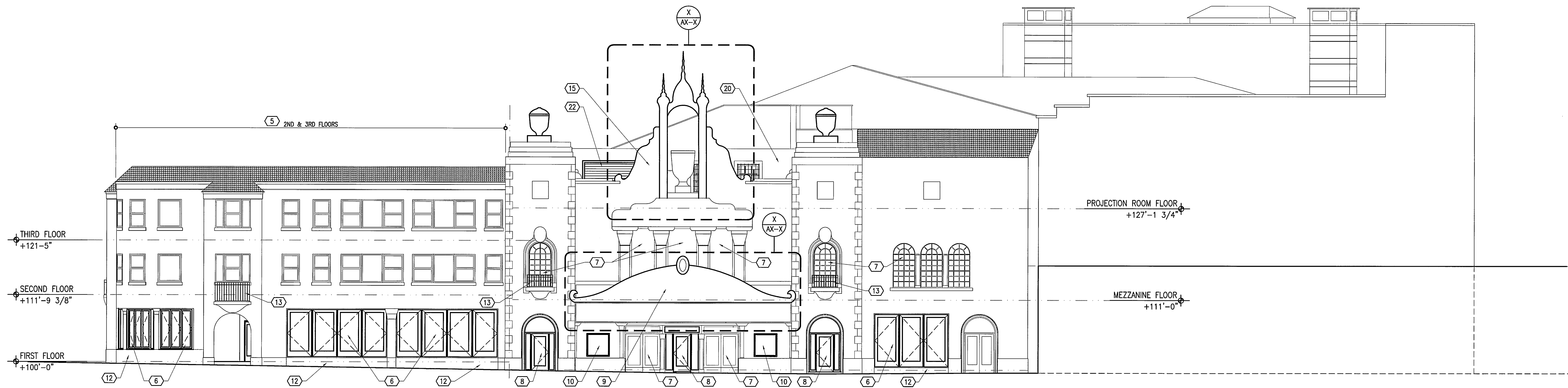
1 EAST ELEVATION (1X2) (21)