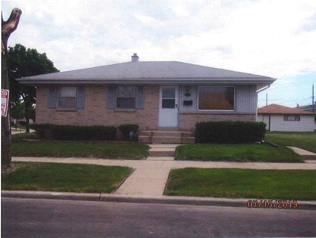
5050 South 16 th Street