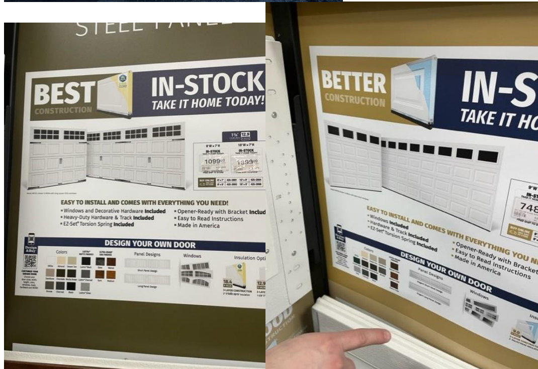
Existing and approved replacement garage doors.