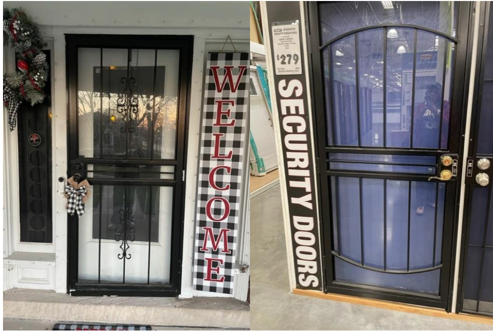
Typical existing security door (left) and approved new security design. May paint color of choice, if desired.