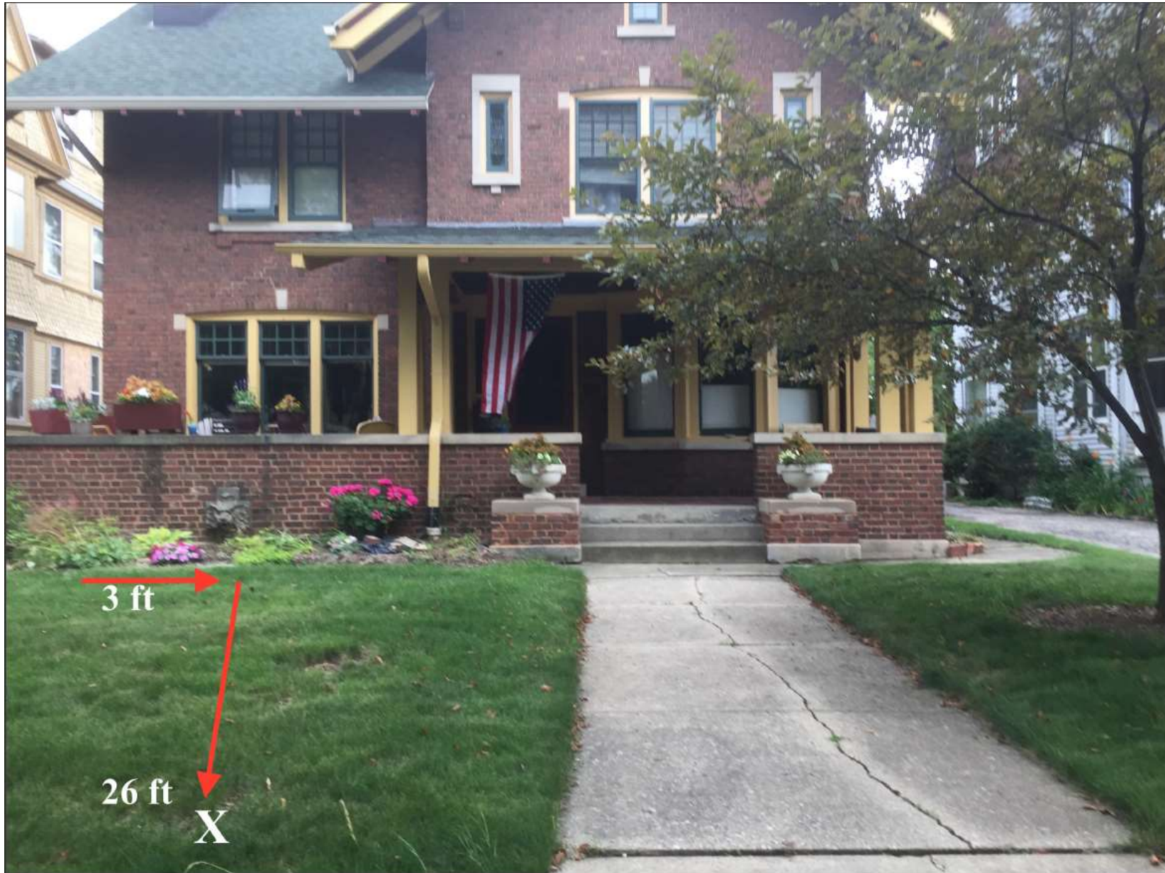
Light location referenced to corner of house