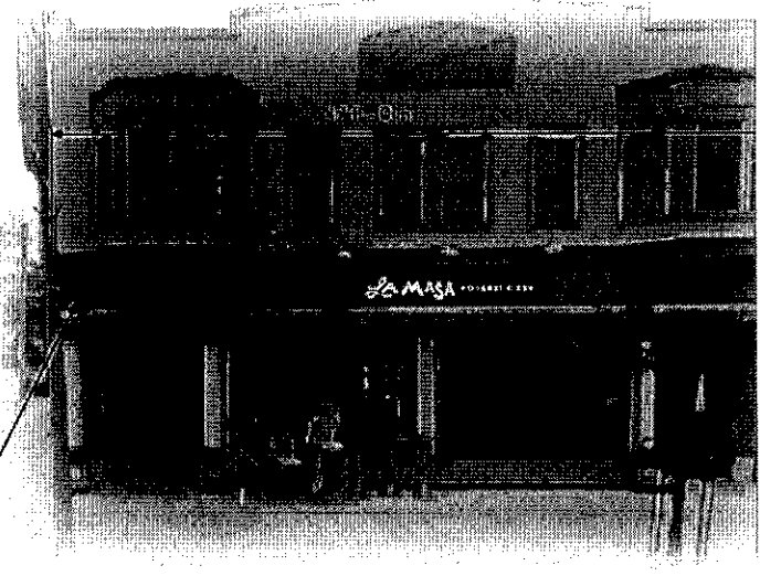
Brady St Frontage