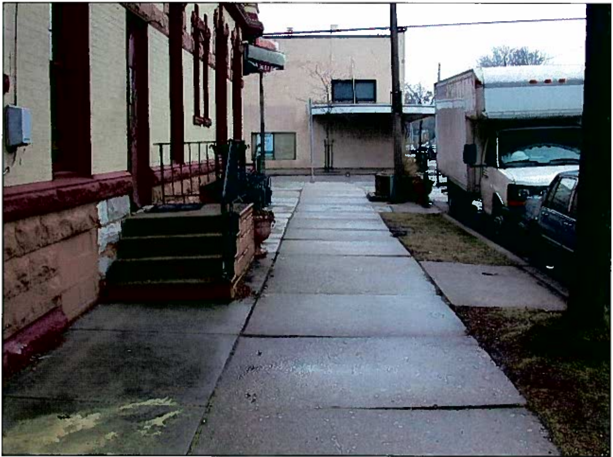
CCF 090895 1006 E Brady St 3-11-2010 Looking S towards Brady St at E sidewalk area of N Astor St.