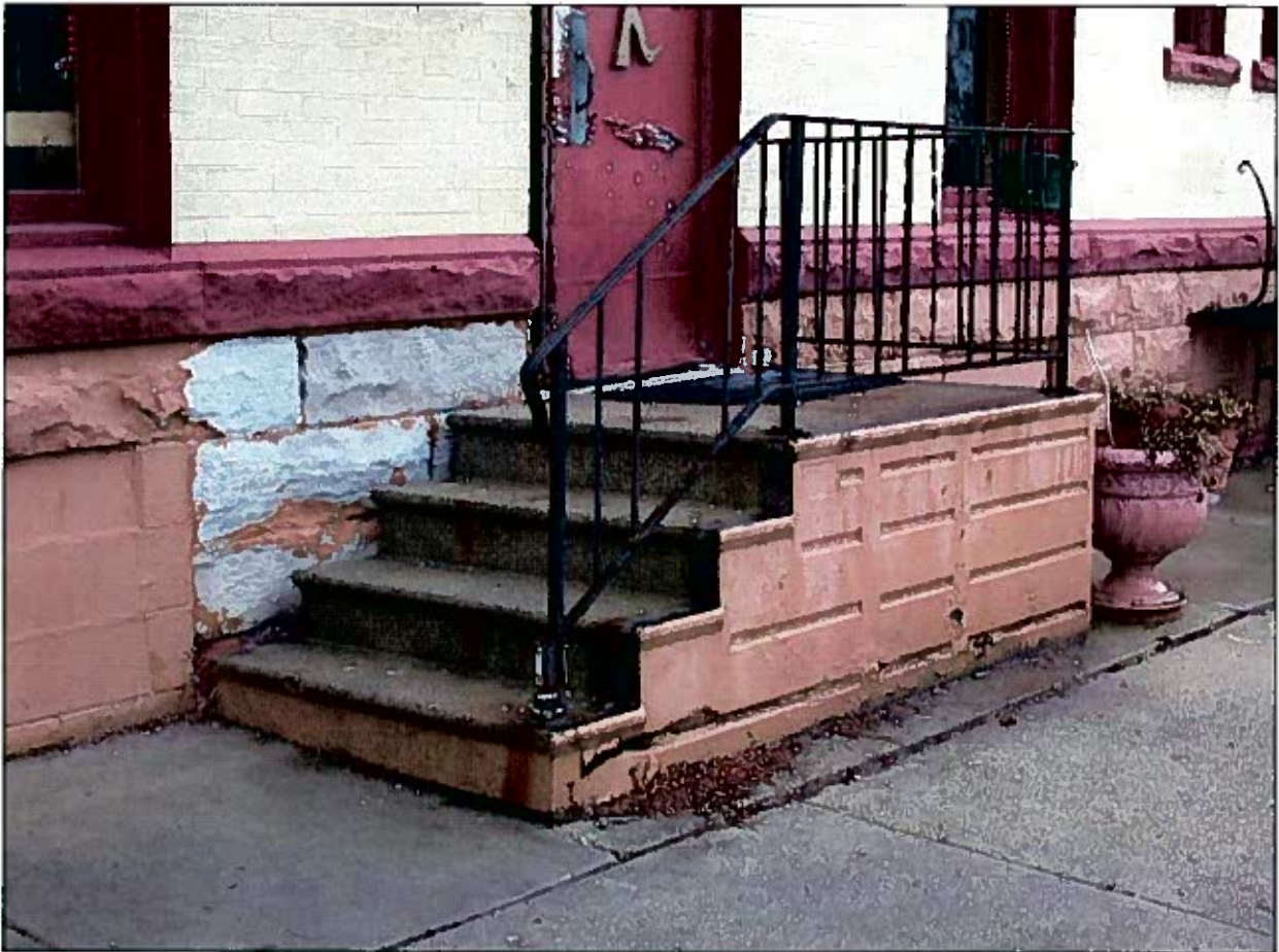
CCF 090895 1006 E Brady St 3-11-2010 Closeup of platform with steps projecting into E sidewalk area of N Astor St