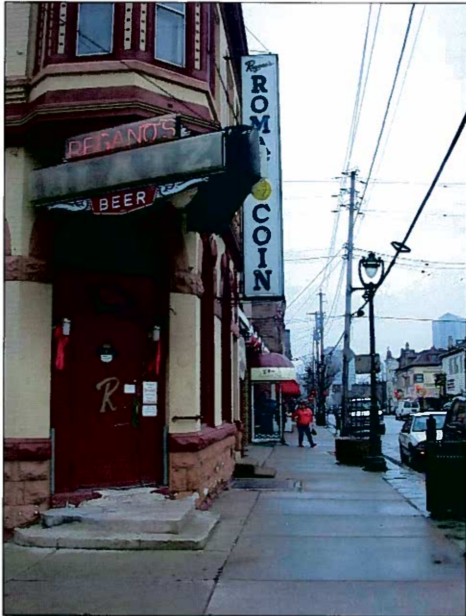
CCF 090895 1006 E Brady St 3-11-2010 Looking E from Astor St at N sidewalk area of East Brady Street.