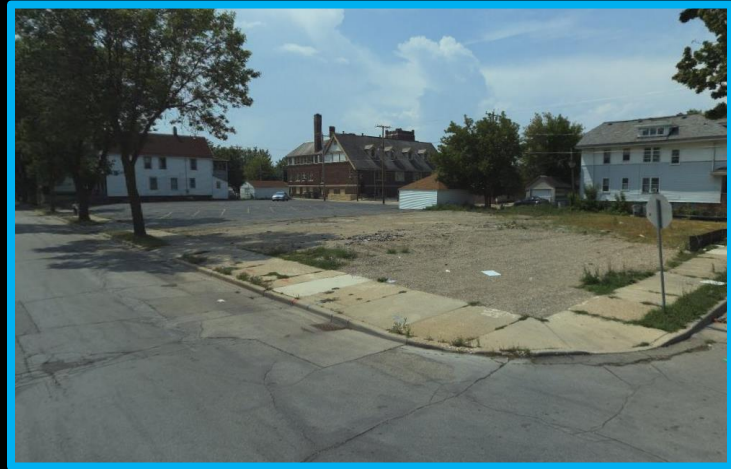
View of Site from corner of W Chambers and N 8th