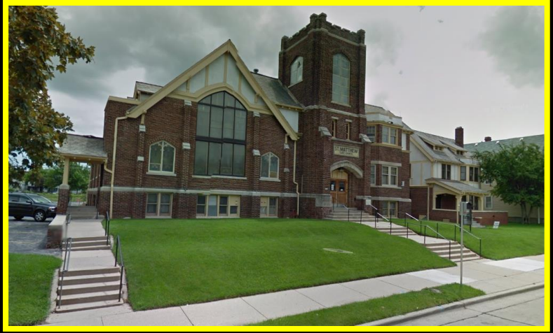
View of existing St Matthew's Church