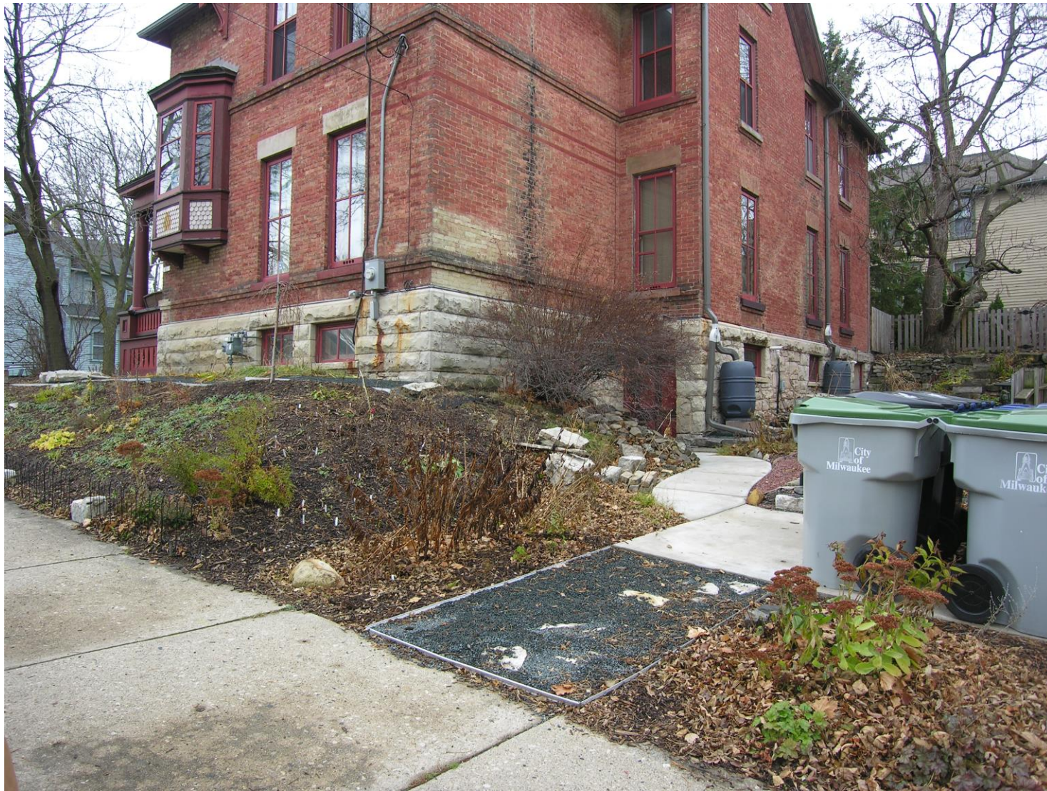
New walkway in place, retaining wall removed and area re-graded, steps to utility box under construction