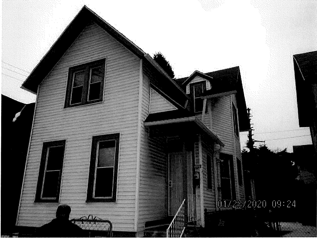
1128 S 10 th Street