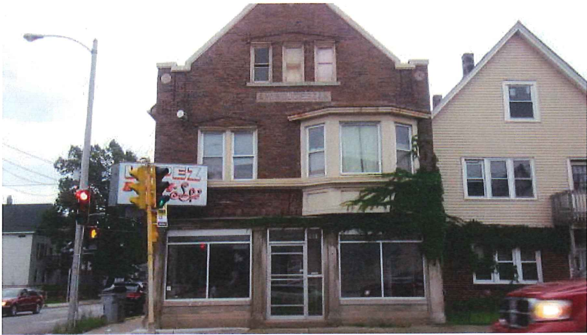
1601 w lincoln