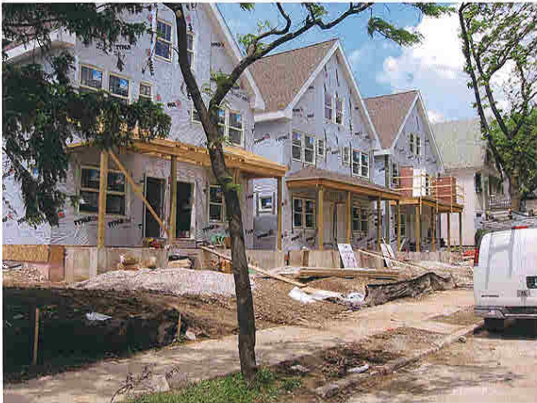
This is a picture of UMSC Townhomes (1929-1943 North 39 th Street), a 2007 WHEDA LIHTC development by UMCS. It is located north of the Development Site.