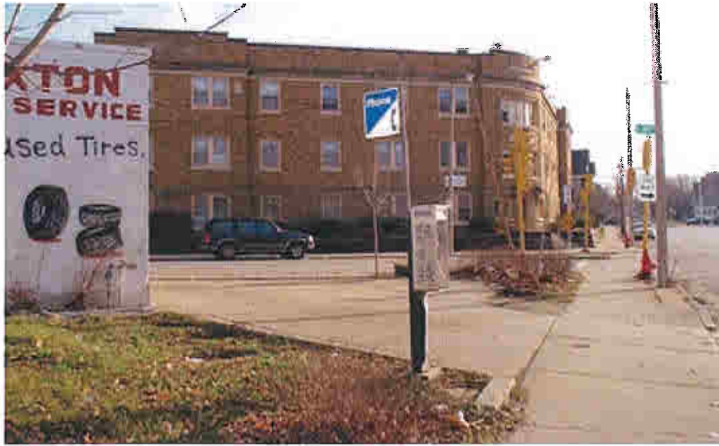
This Property (4002 West Lisbon Avenue) is just west of UMCS' current facility.