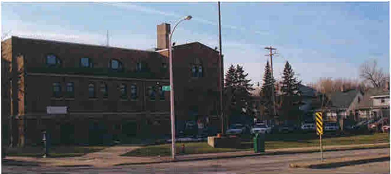
This Property (3903 West Lisbon Avenue) is south of the Development Site.