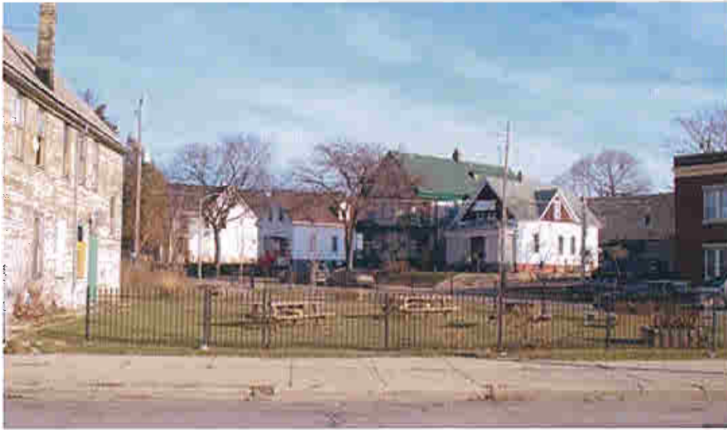
This vacant lot (3900 West Lisbon Avenue) is the easternmost parcel of the Development Site.