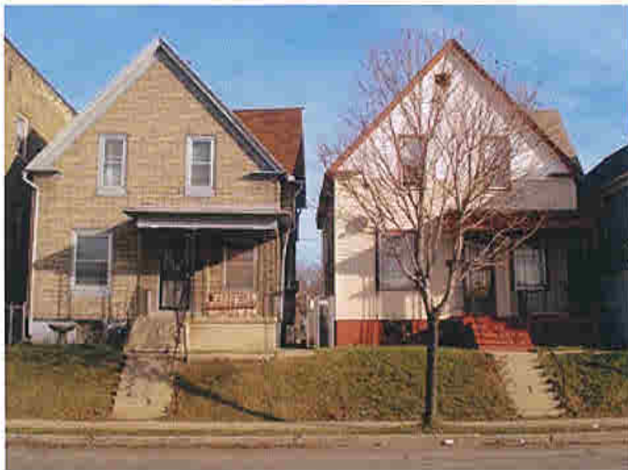
These parcels (3920 and 3924 West Lisbon Avenue) are part of the Development Site.