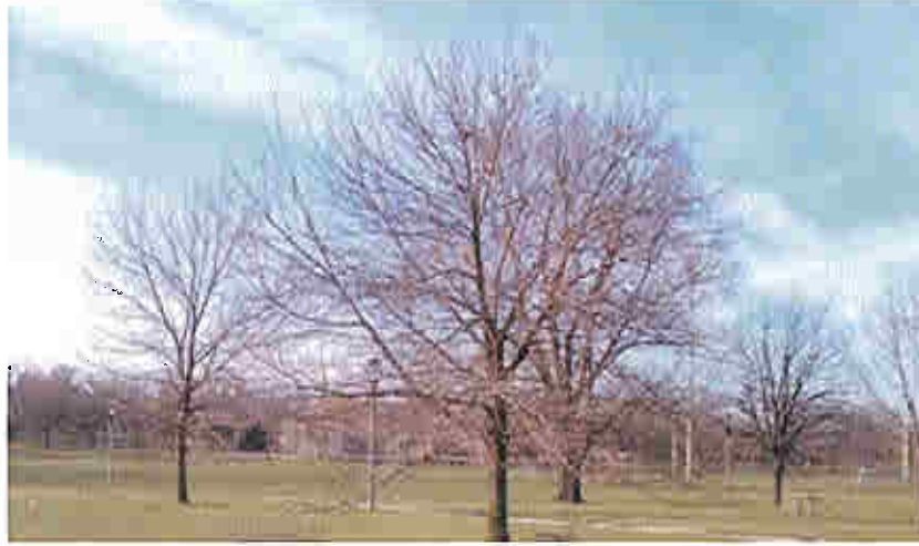
Washington Park, a 124 acre Milwaukee County Park designed by Frederick Law Olmsted is southeast of the Development Site.