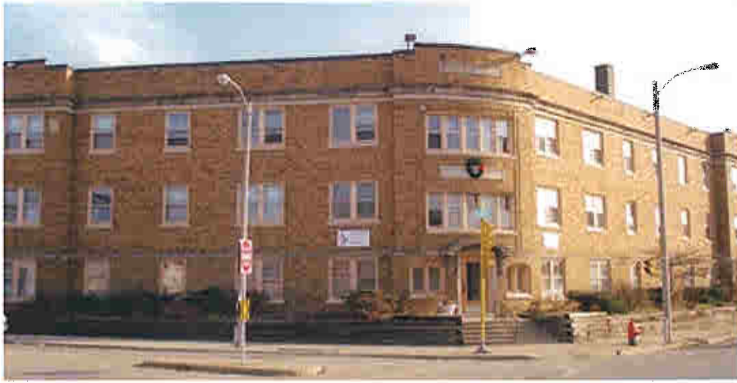
UMCS' current facility (3940 West Lisbon Avenue) is just west of the Development Site.