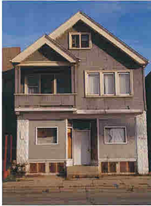
This parcel (3916 West Lisbon Avenue) is part of the Development Site.