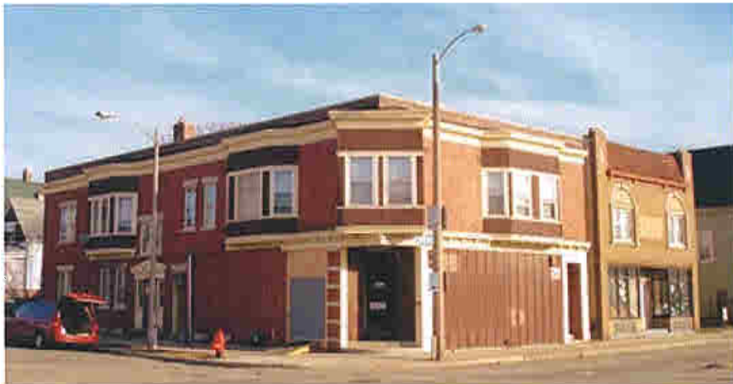
This building (3832 West Lisbon Avenue) is located just east of the Development Site.