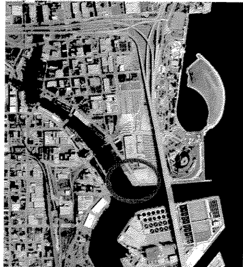
Aerial photograph of the site and surroundings

As DCD staff has shared the winning design with various stakeholder groups, several questions have arisen. The following page is a compilation of those questions and answers.