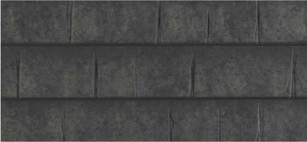
Castle Gray CRRC# 0668-0145