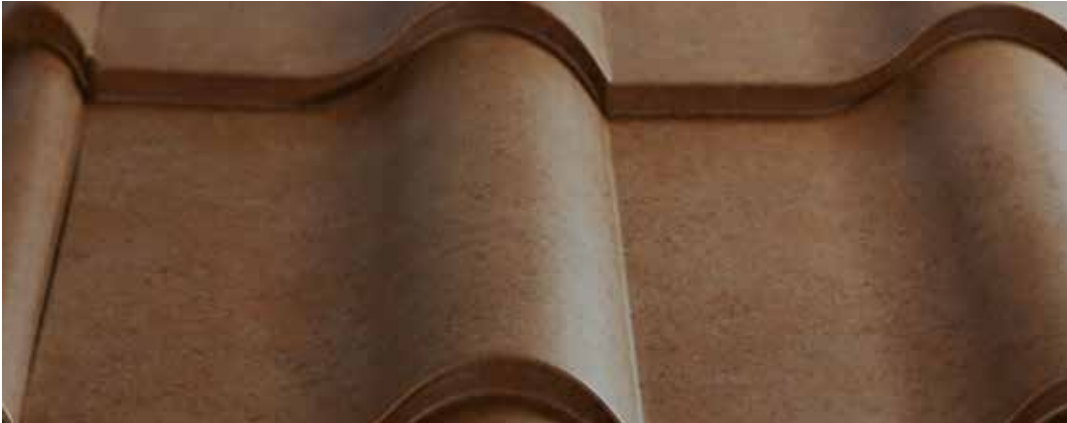
Brick Blend CRRC# 0668-0102