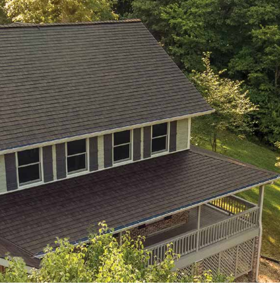
Shown in Weathered Wood