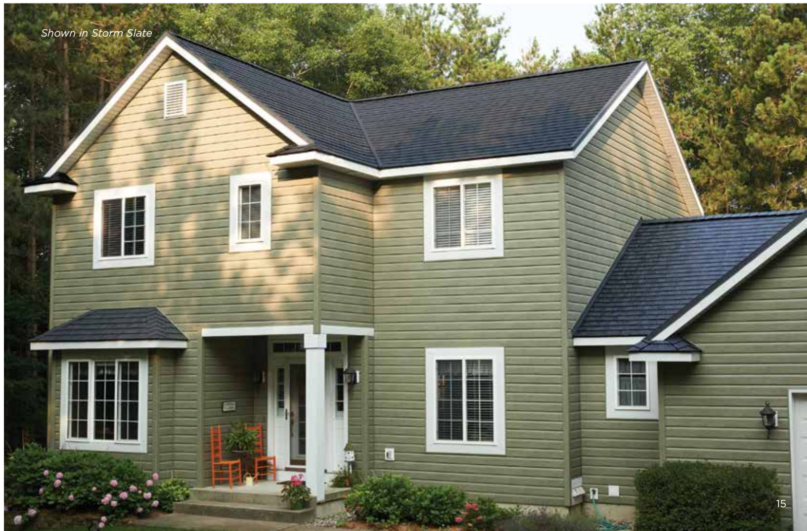
Shown in Storm Slate