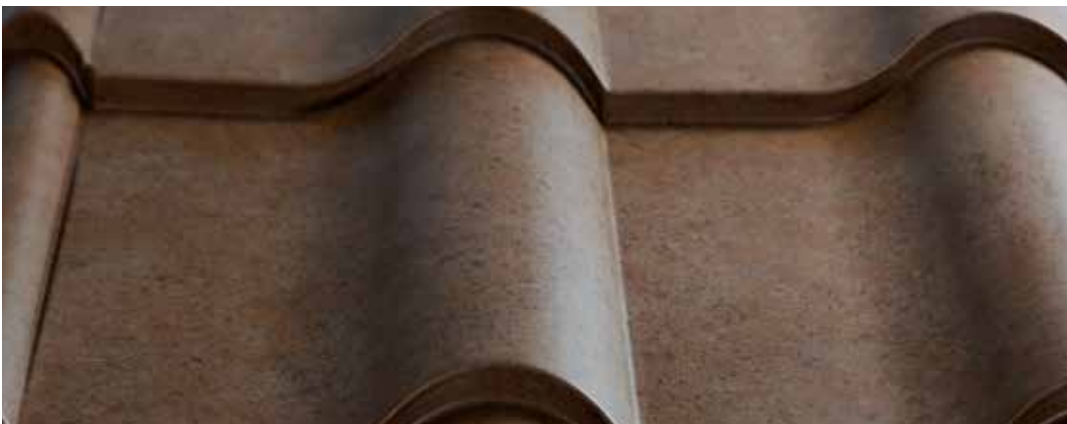
Tuscan Stone CRRC# 0668-0105