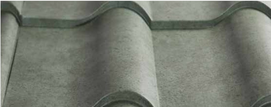
Jade CRRC# 0668-0103