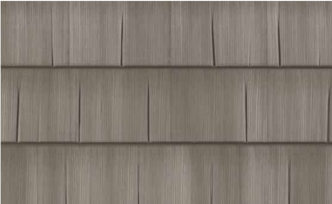
Shorewood CRRC# 0668-0110