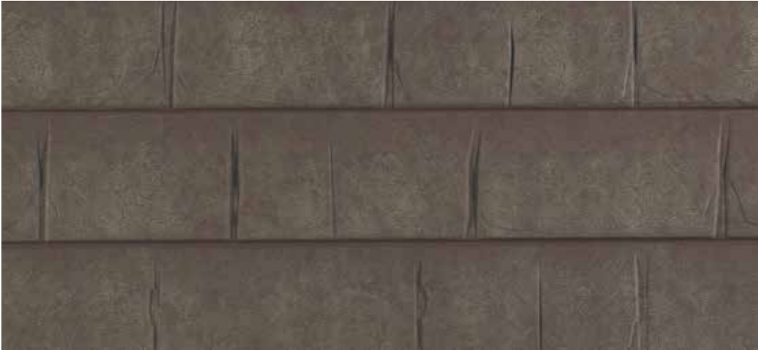
Brownstone CRRC# 0668-0109