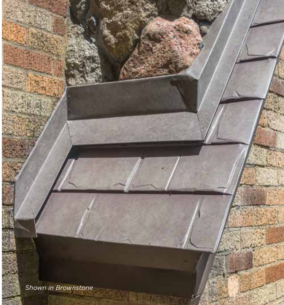
Shown in Brownstone