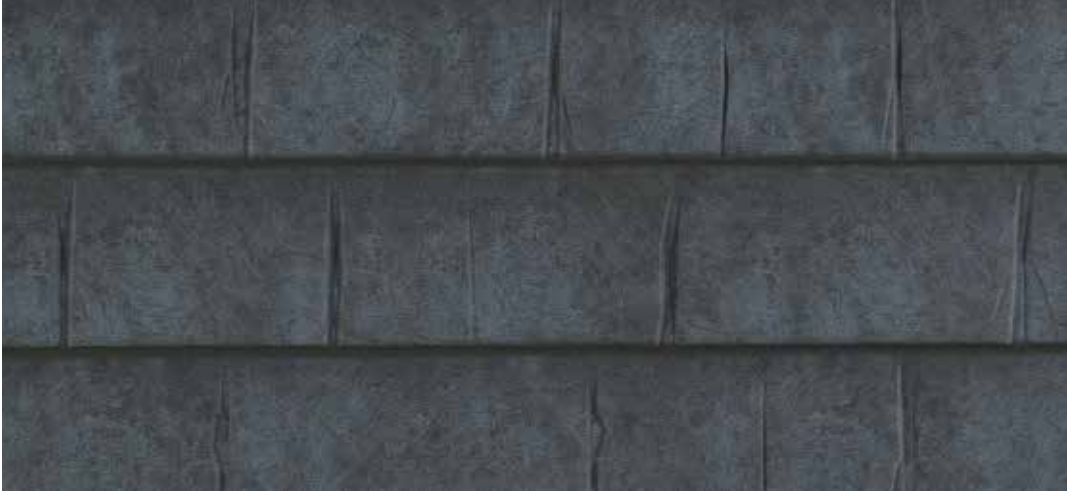
Cobalt CRRC# 0668-0144