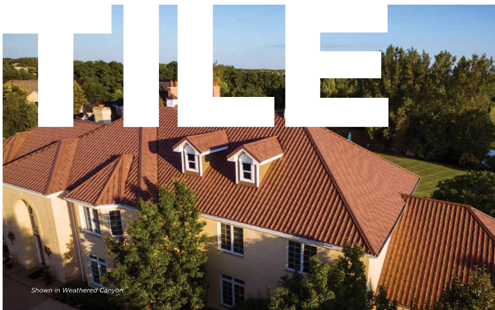
Shown in Weathered Canyon