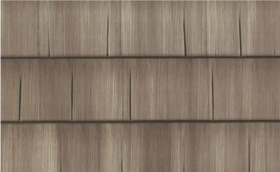
Cedar CRRC# 0668-0107