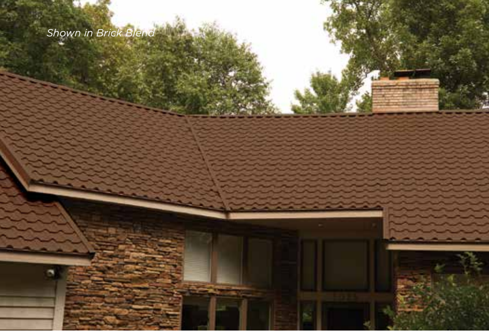
Shown in Brick Blend