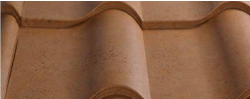
Terracotta CRRC# 0668-0104