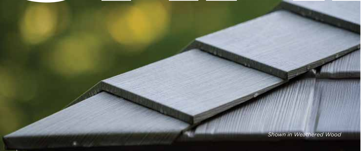
Shown in Weathered Wood