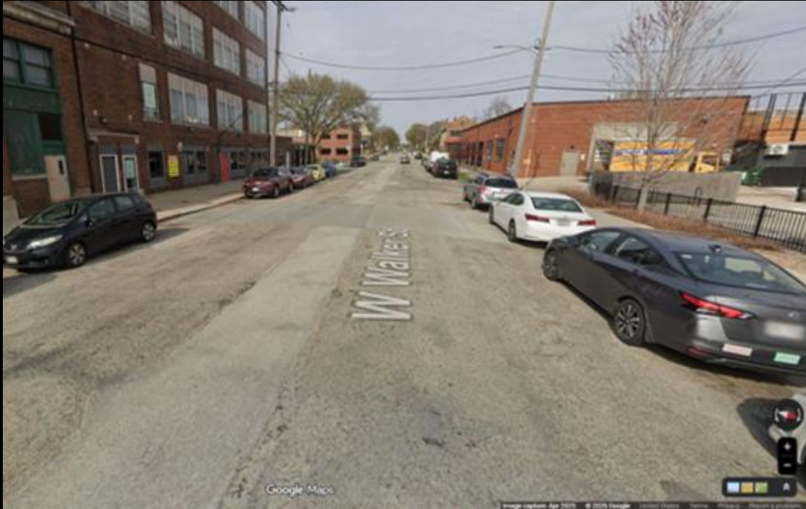
W Walker Street