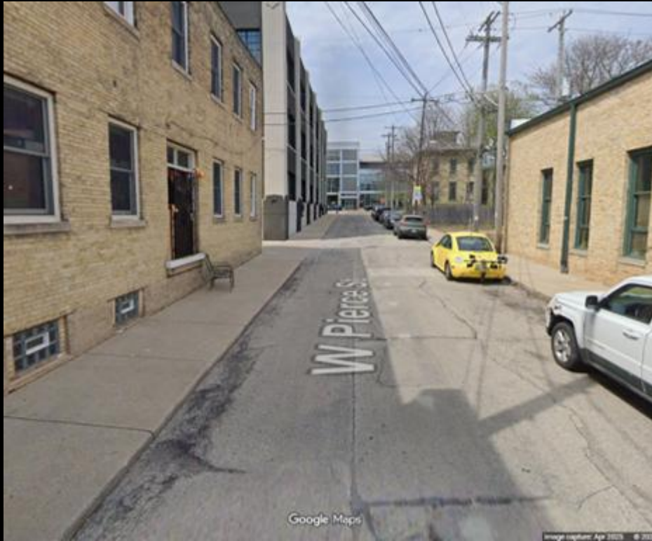
W Pierce Street