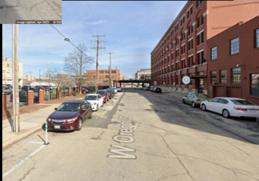
W Oregon Street