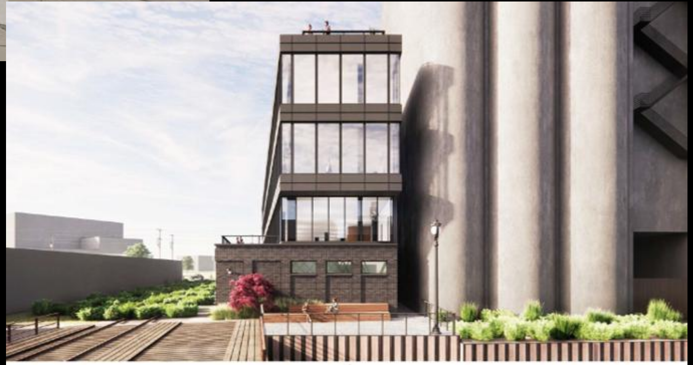
350 South Water Street