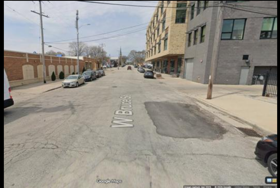
W Bruce Street