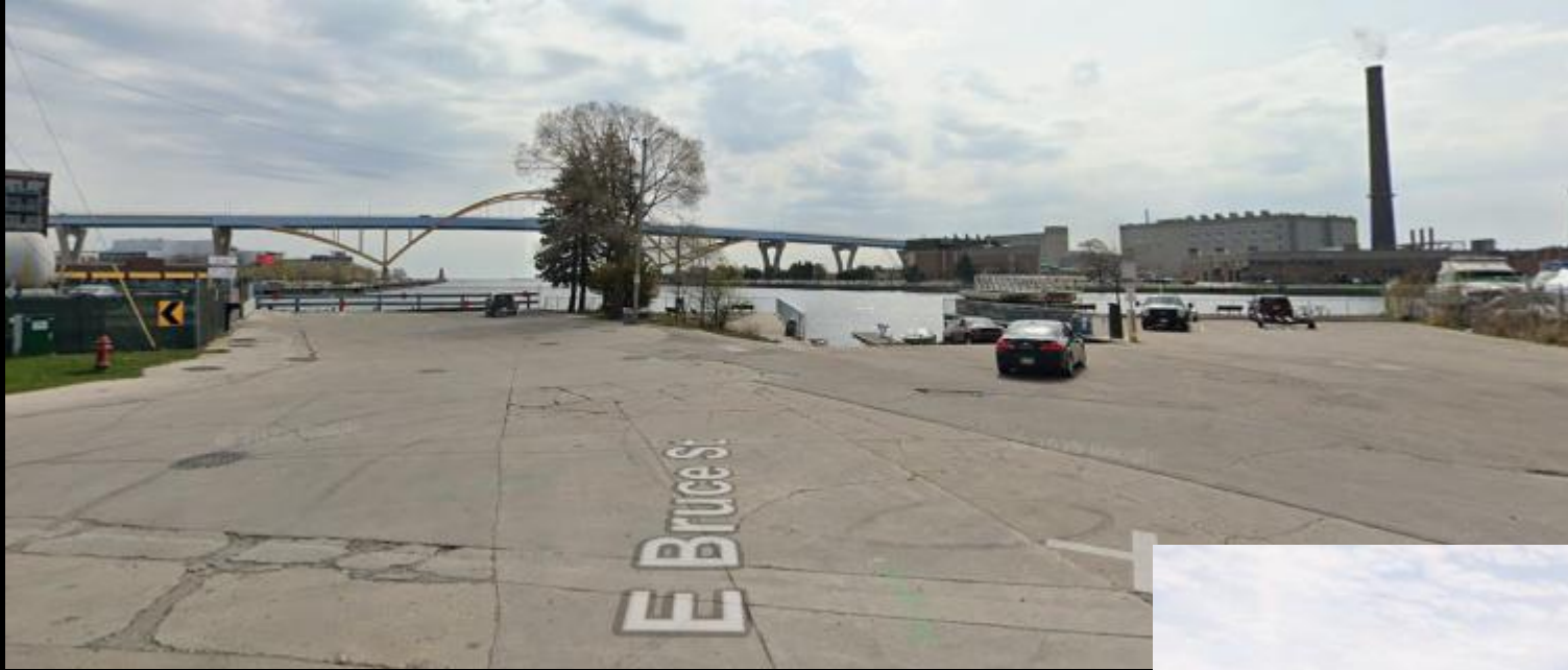
Bruce Street Boat Launch