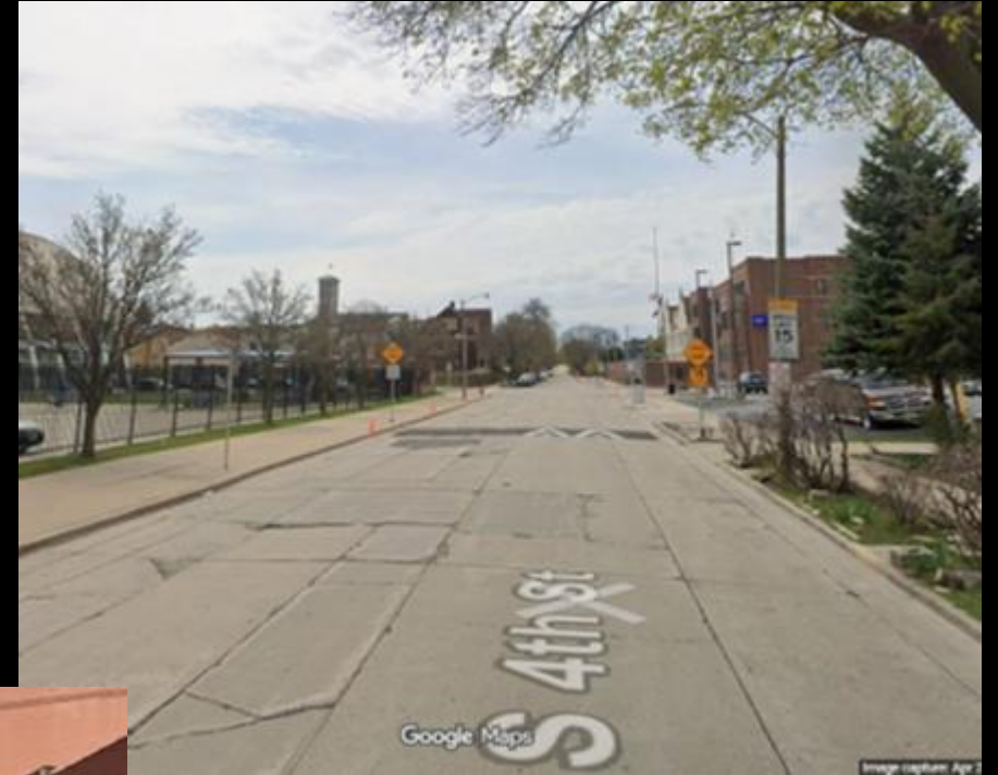
S 4 th Street