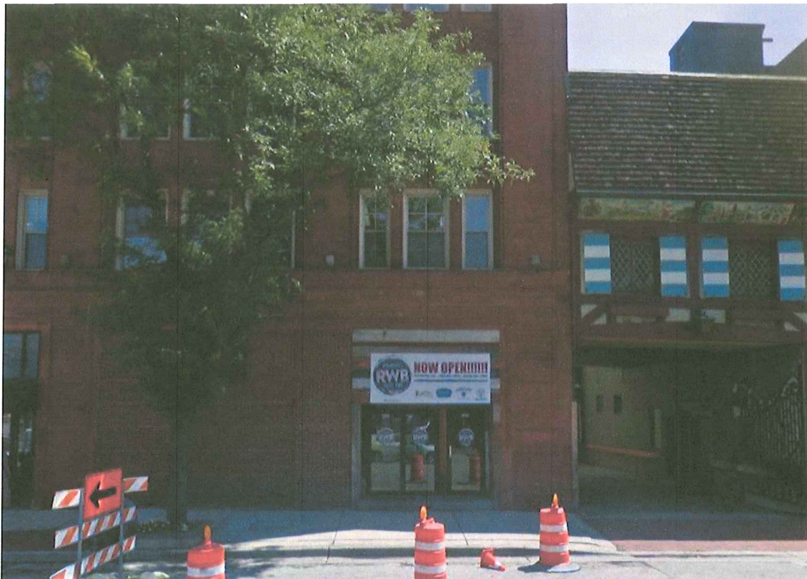
Street view of the property ca. Aug. 2018