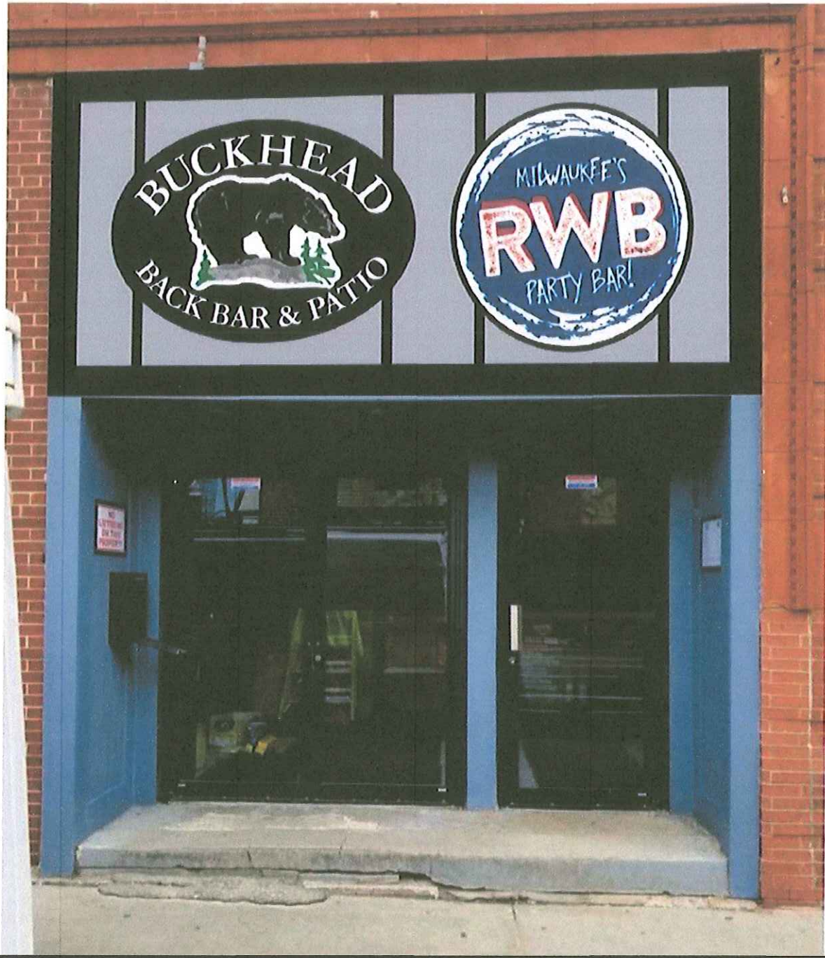
Rendering of the proposed signage