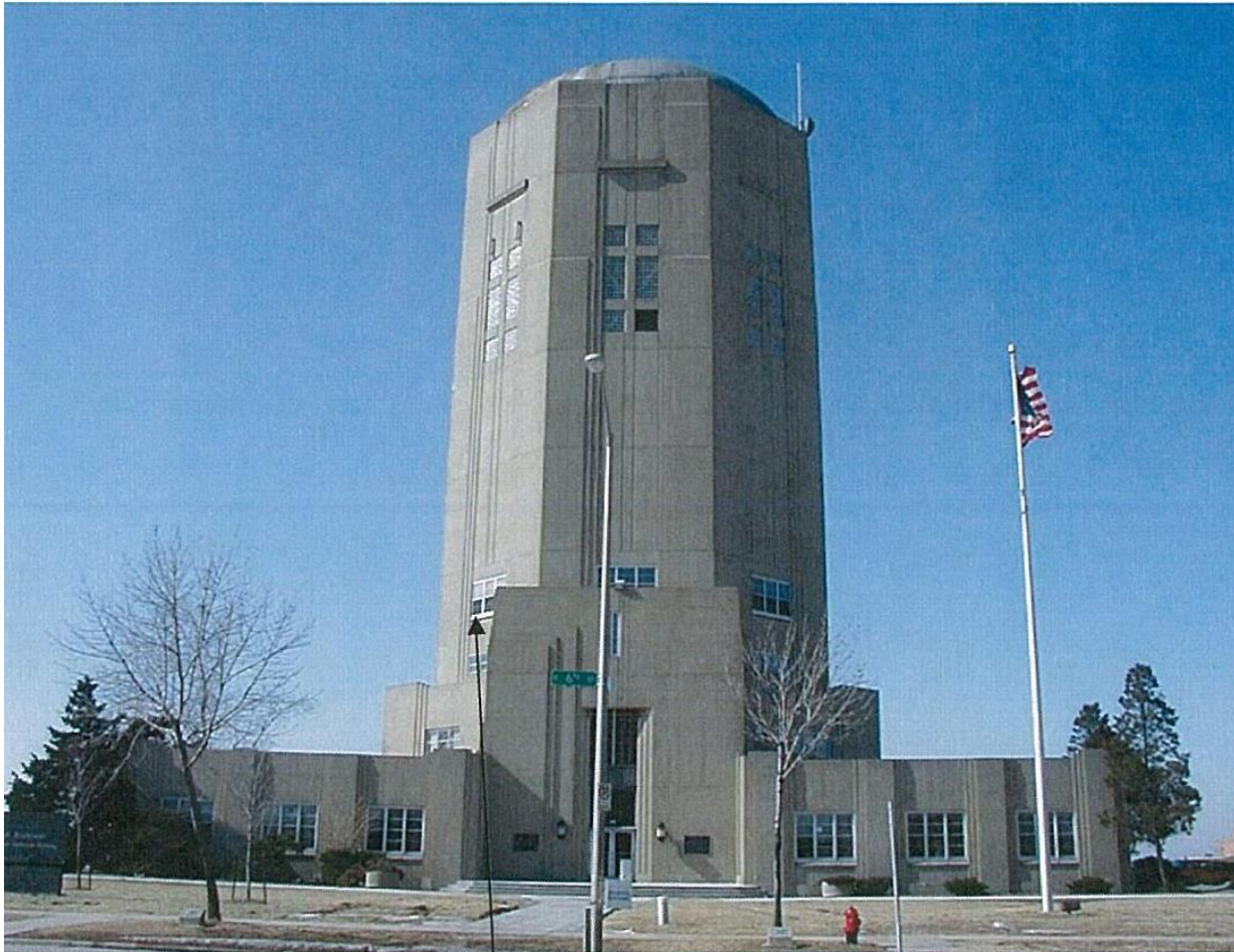
Fig. 1 EXISTING Elevation Looking West

Install 35 x 67 louver in existing window opening.