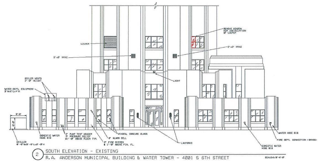
Drawing 1 EXISTING ELEVATION Looking North