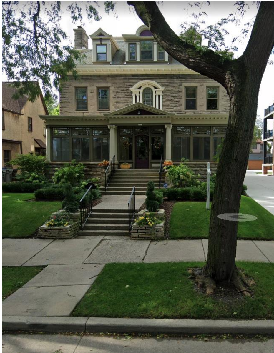
Google Street View photo of 2641 N Lake Drive, showing chimney and roof condition as of October 2019