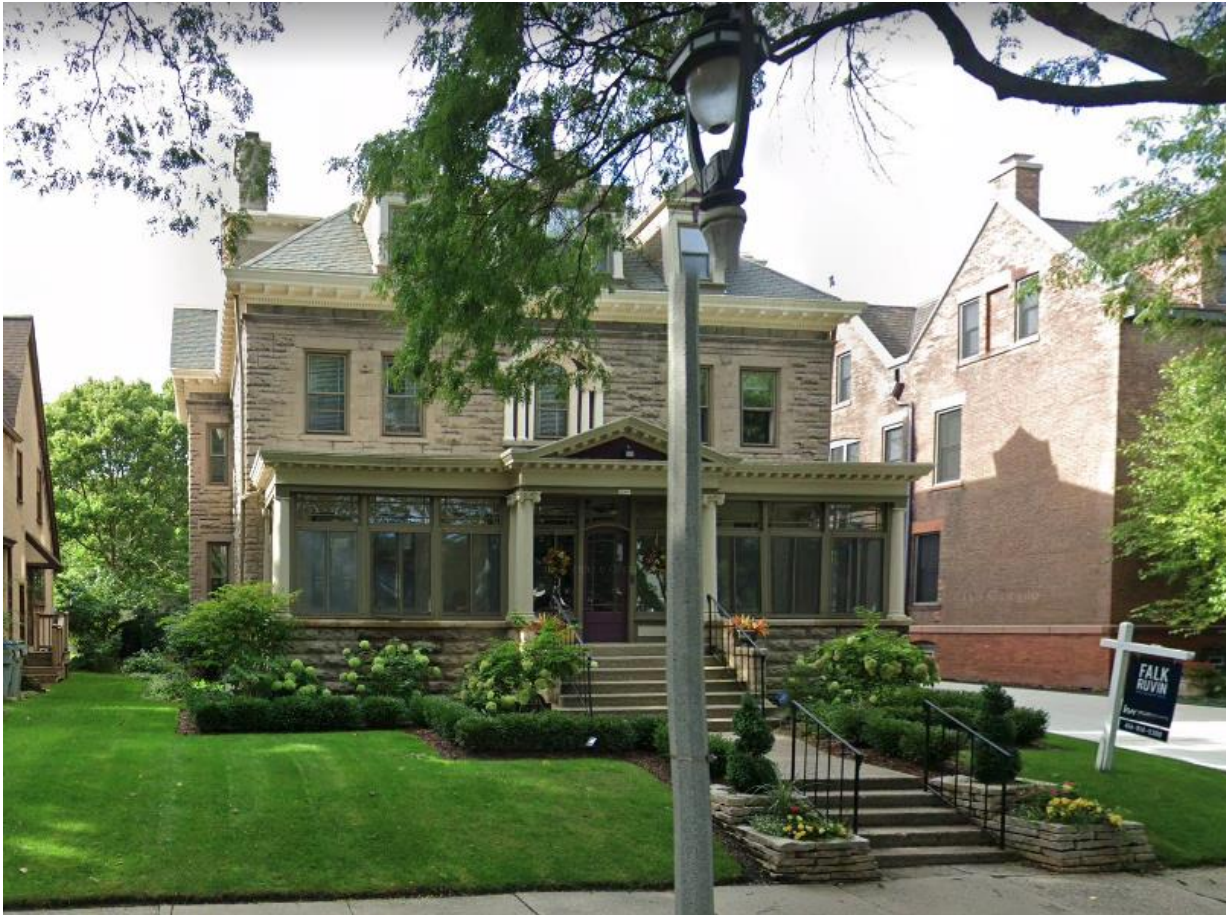
Google Street View photo of 2641 N Lake Drive, showing portion of side yard where fence will be visible

Copies to: Development Center, Ald. Bauman