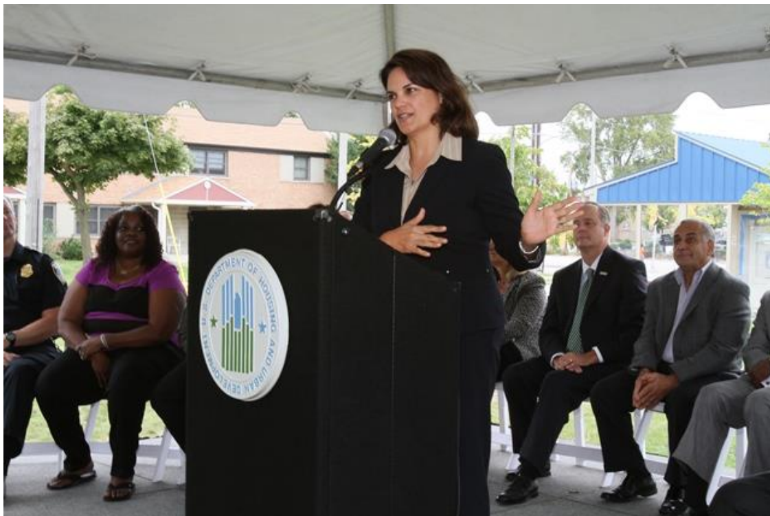
U.S. Department of Housing and Urban Development (HUD) Deputy