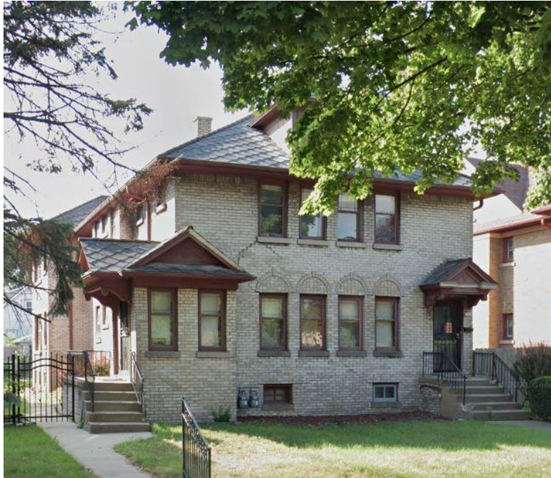
3129 N. Sherman Boulevard