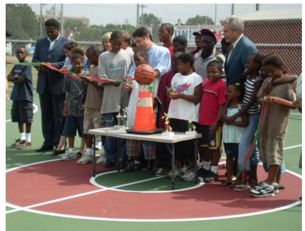
The youth were invited to assist with the ribbon cutting.