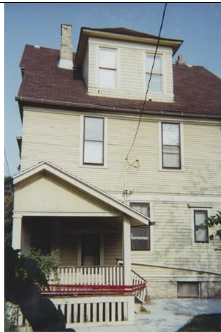
Undated rear photo, c. 2000