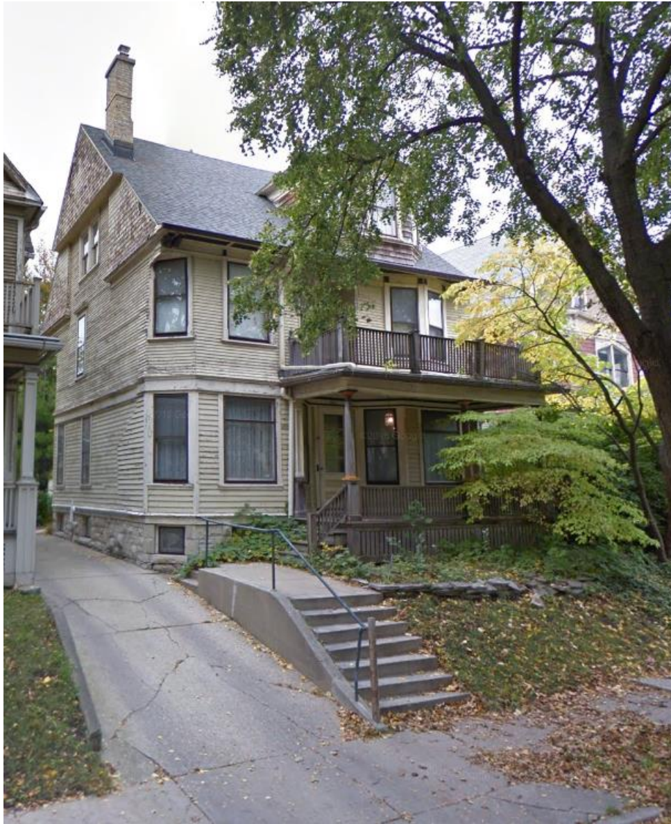
Image of the property fall 2016