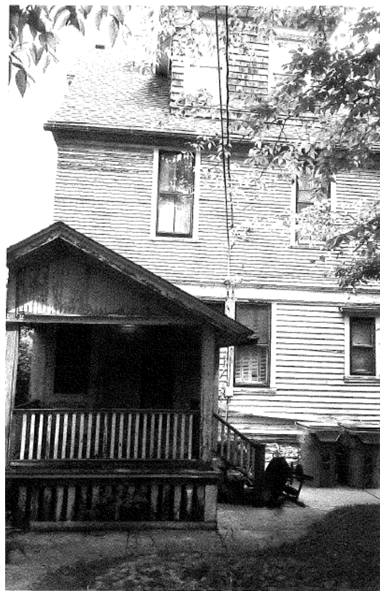
Current rear photo