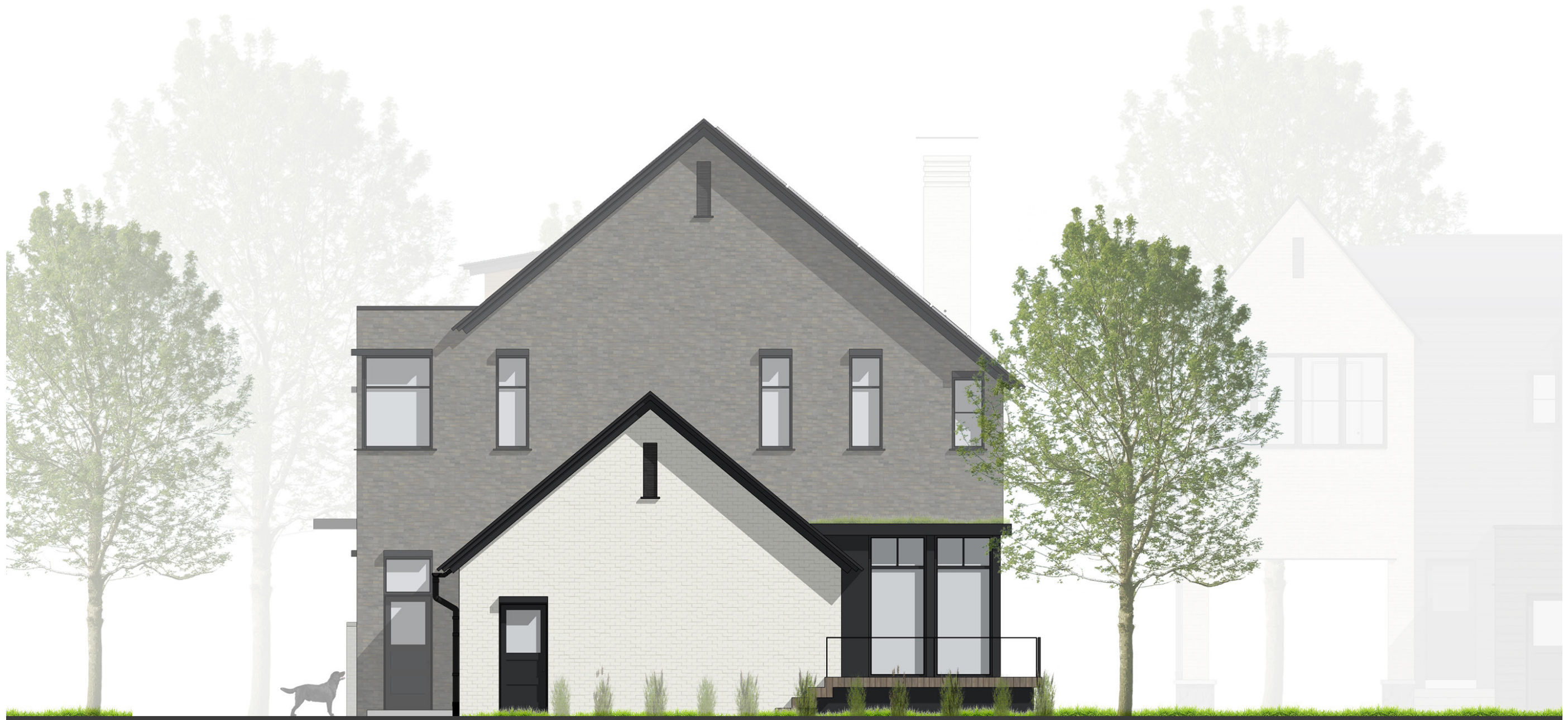
WEST (REAR) ELEVATION