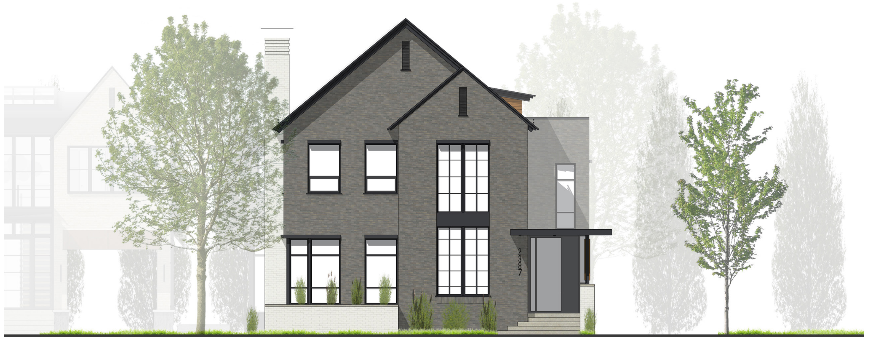
EAST (FRONT) ELEVATION