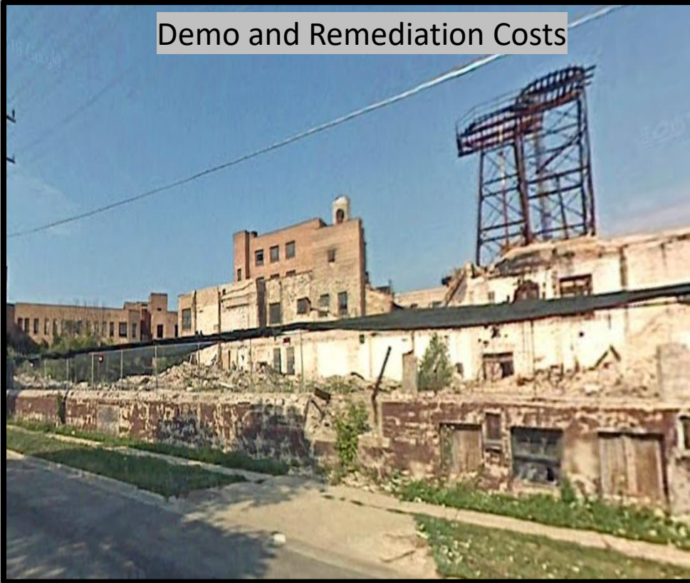
Demo and Remediation Costs