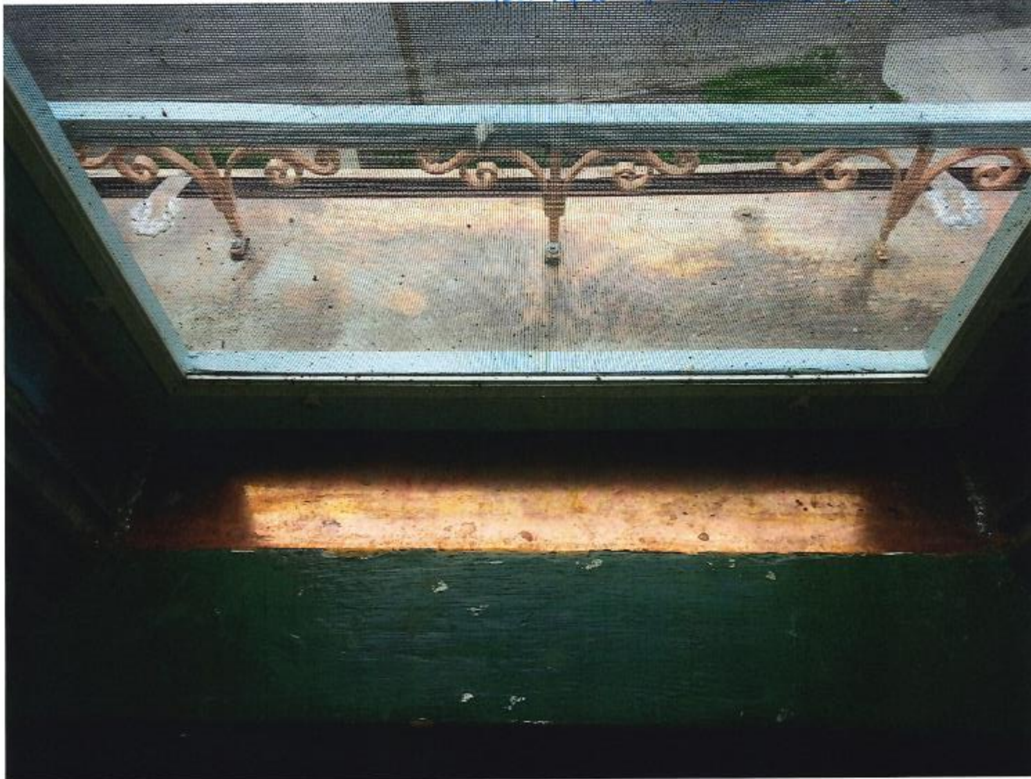
New ledges on turret and railing before removal and repair

New ledge beneath turret window sills d2 copper replacing tin and restored railing