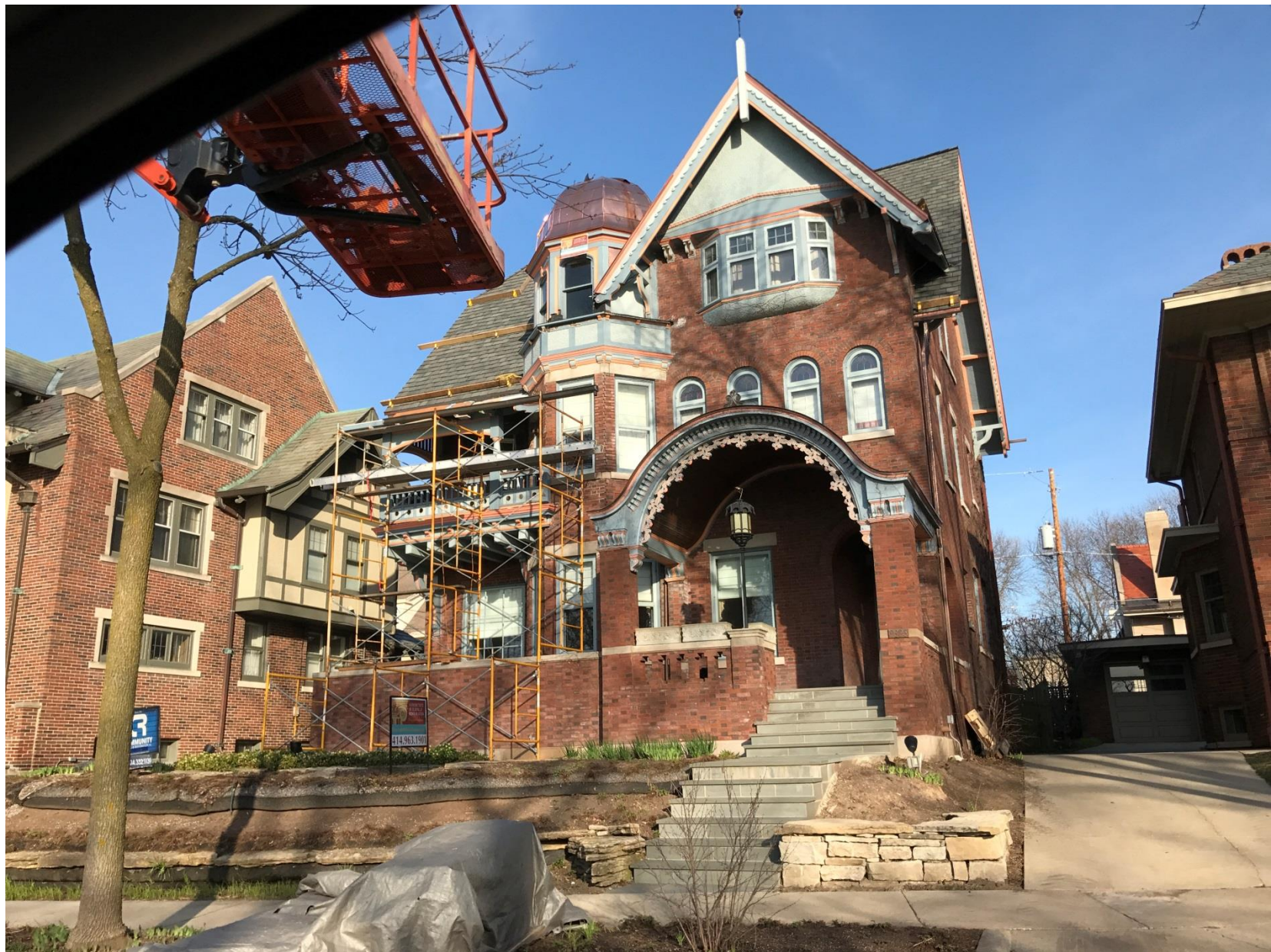
Conditions as of April 18, 2017. Note lamppost on porch at stairs.