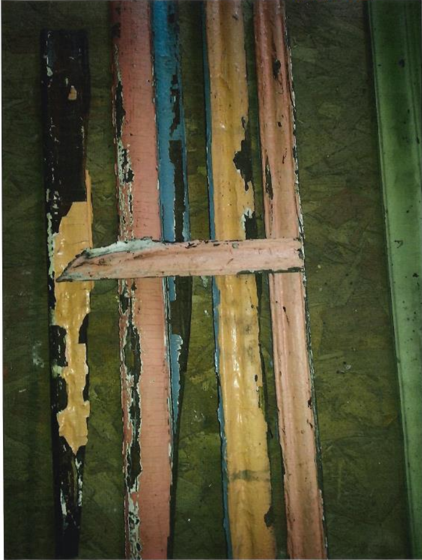
Condition of trim work on turret