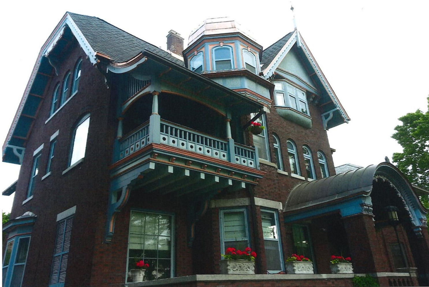
Work complete, except for reinstallation of turret railing.

E2 East view turret restoration complete.