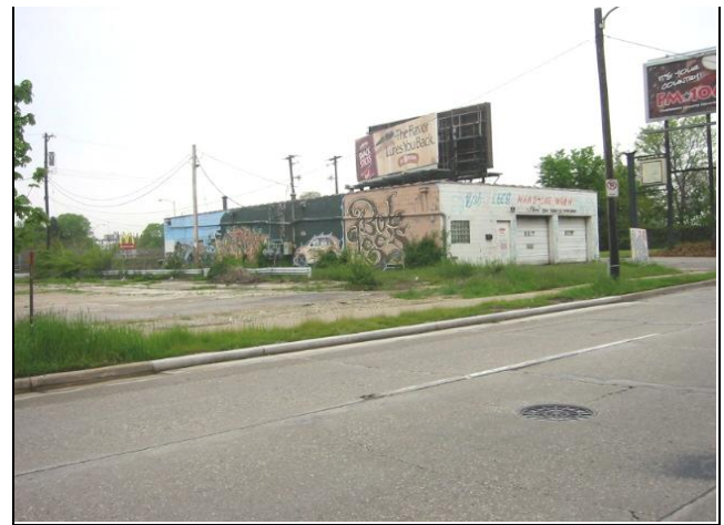
A single-story, hand carwash having 3,200 square feet of operating area on a 12,450 SF parcel.