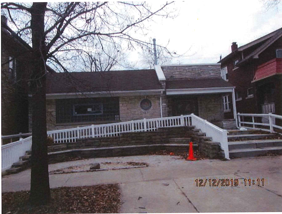
1107 W Oklahoma Ave