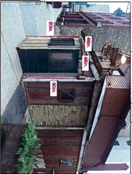
PHOTOGRAPH OF EXISTING STRUCTURE