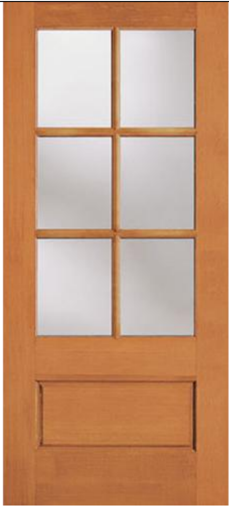
Approved door design