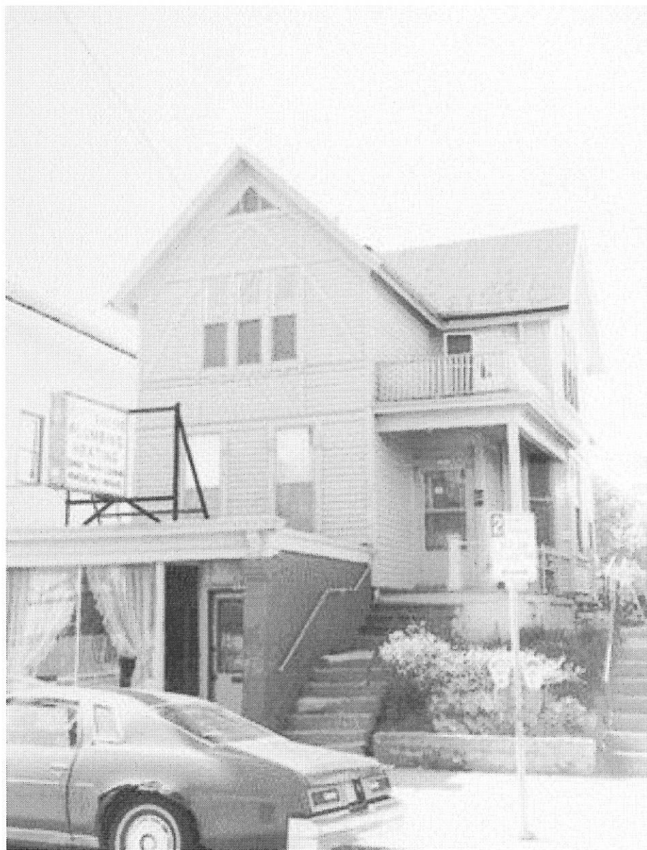
1988 photo of the building before the Brady Street local historic district was created.