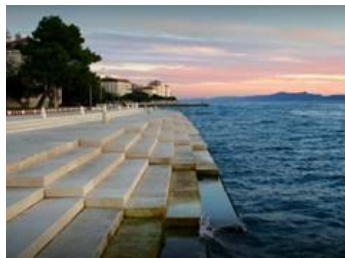
Zadar, Croatia (Sea Organ, Adriatic Sea)