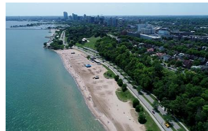
Milwaukee, WI USA (Great Lakes Fresh Coast)