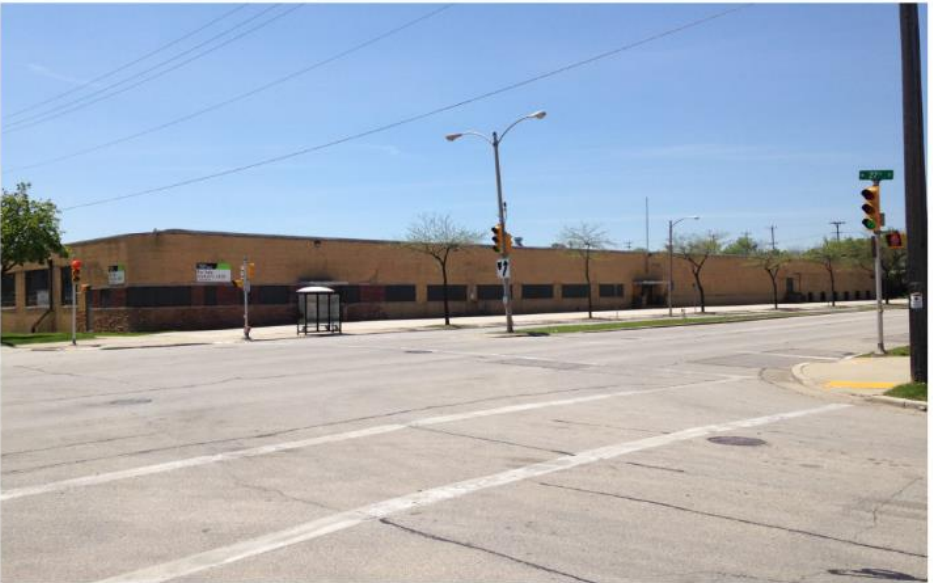
Site and accessory buildings