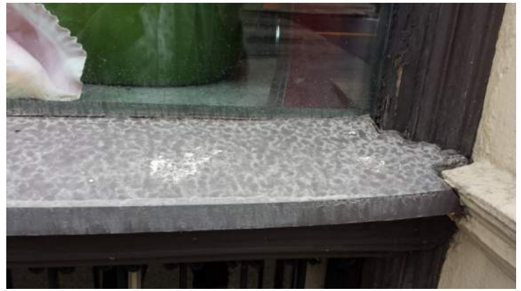
Photo 15, 16 – Typical condition of replacement sill material at first floor windows.