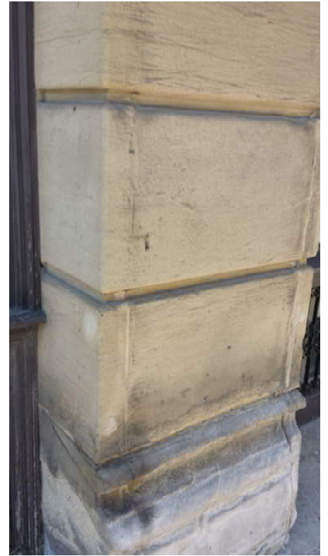
Photos 17-19 – Typical conditions of Cleveland sandstone corners, pilaster base.