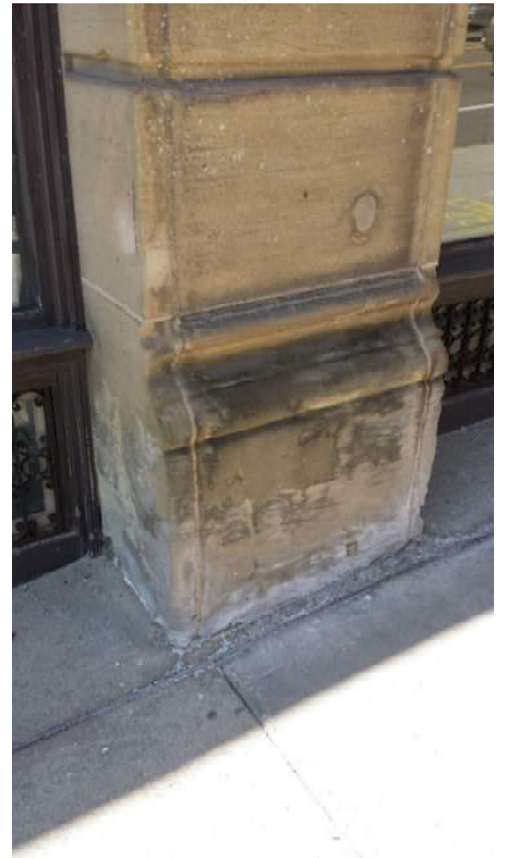
Photos 20,-22 – Southern elevation, typical conditions of Cleveland sandstone base with presence of spalling, efflorescent salts..