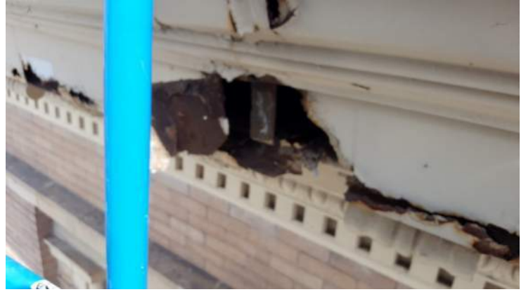
Photos 5, 6 – Corroded formed, painted metal cornice trim. South elevation, western-end.