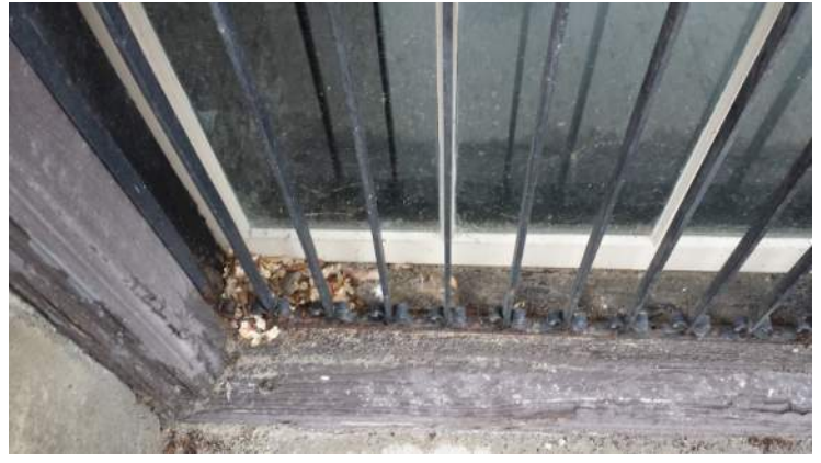
Photos 11-14 – Sidewalk level window frame, sills, typical condition. South elevation views.