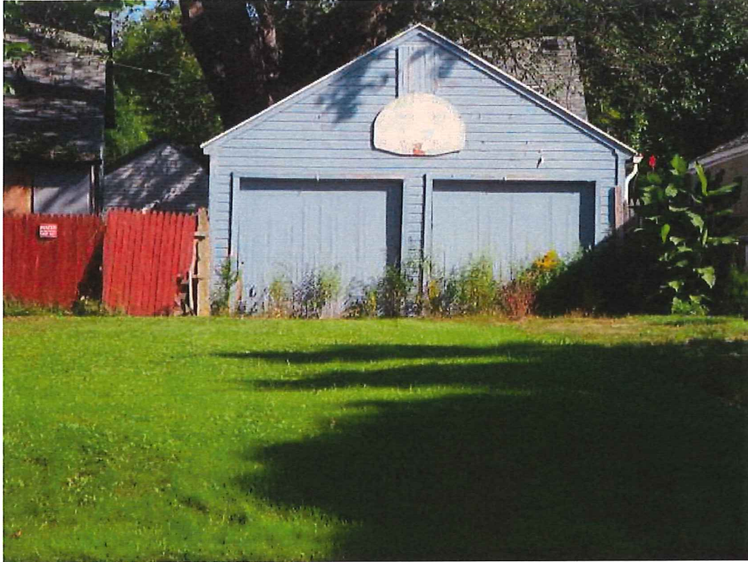
4230 w Thurston