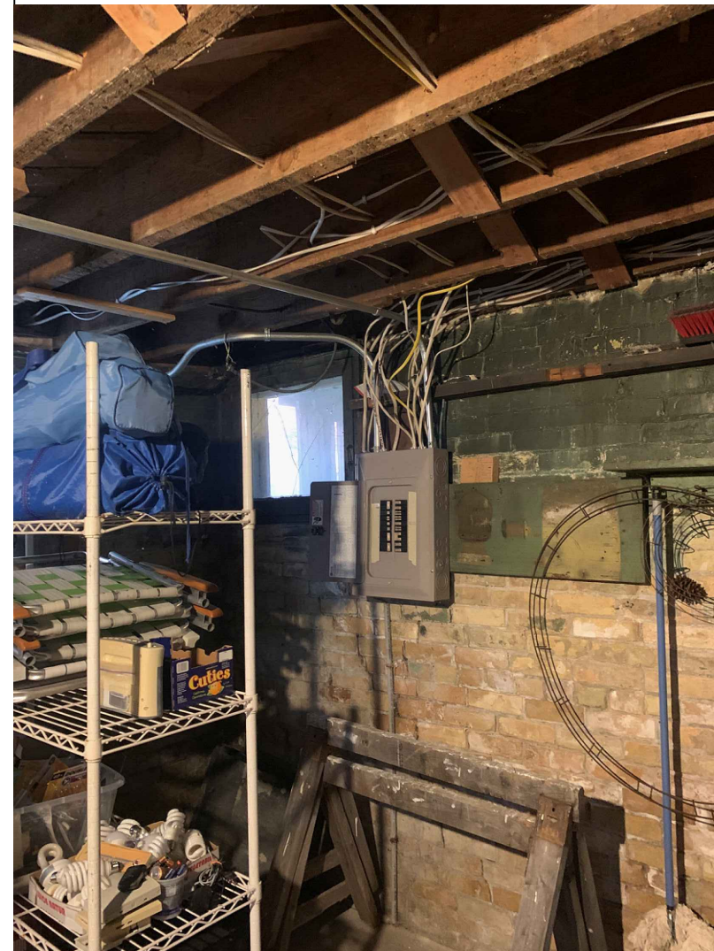
Main service panel in basement.