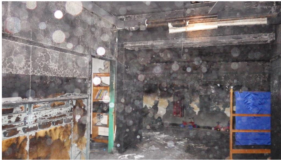
Fire damaged area, airborne particles present 2001 West Vliet Street