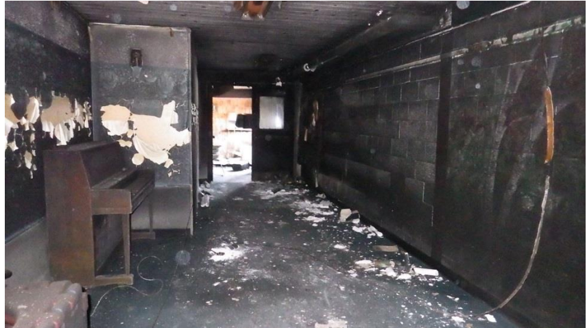
Fire damage, 2001 West Vliet Street