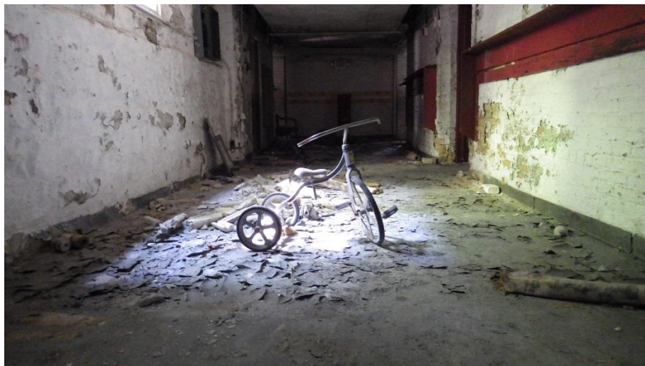
Interior hallway photo, 2001 West Vliet Street