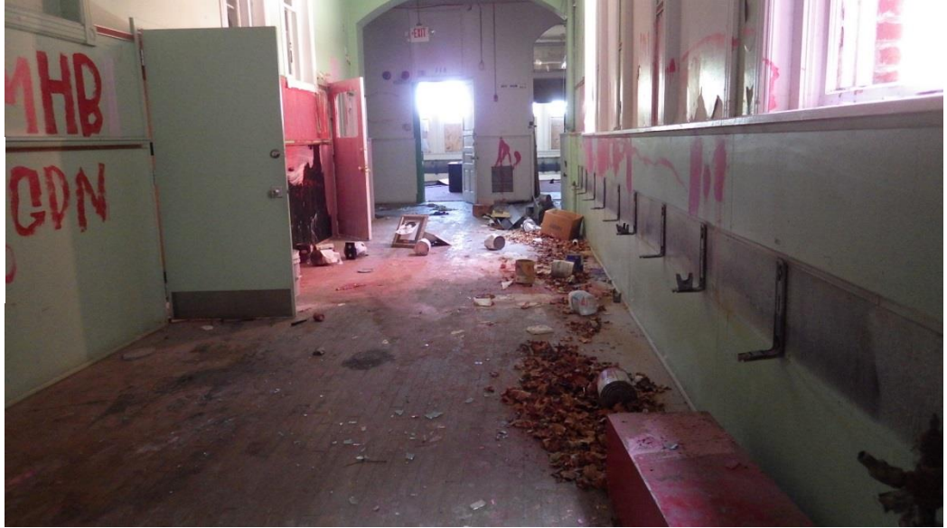
Interior hallway, 2001 West Vliet Street