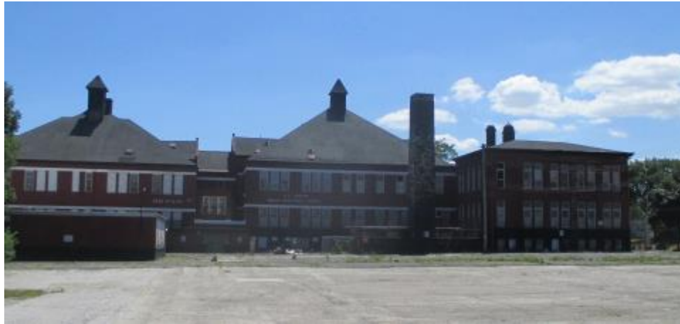
Above: 2001 West Vliet Street – North elevation

The Property was fire damaged in November of 2013 and has not been occupied since that time. A condemnation order was issued by the Department of Neighborhood Services. The site has fallen into disrepair and requires significant renovation as well as environmental remediation. The Wisconsin Department of Natural Resources identified multiple hazards within the building and confirmed that entry should not occur to the Property until the hazards are contained and/or removed. The Department of City Development ("DCD") has been working with the U.S. Environmental Protection Agency ("EPA") and a contractor of the EPA since April of 2017 to remediate environmental hazards within the building on the Property. Due to the raze order on the premises and the significant environmental concerns, the Property poses significant redevelopment challenges.