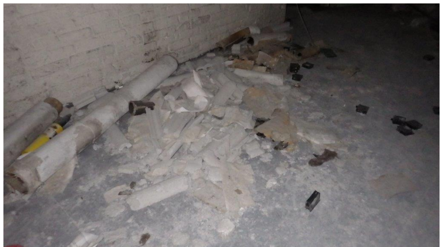
Friable asbestos containing pipe insulation, 2001 West Vliet Street