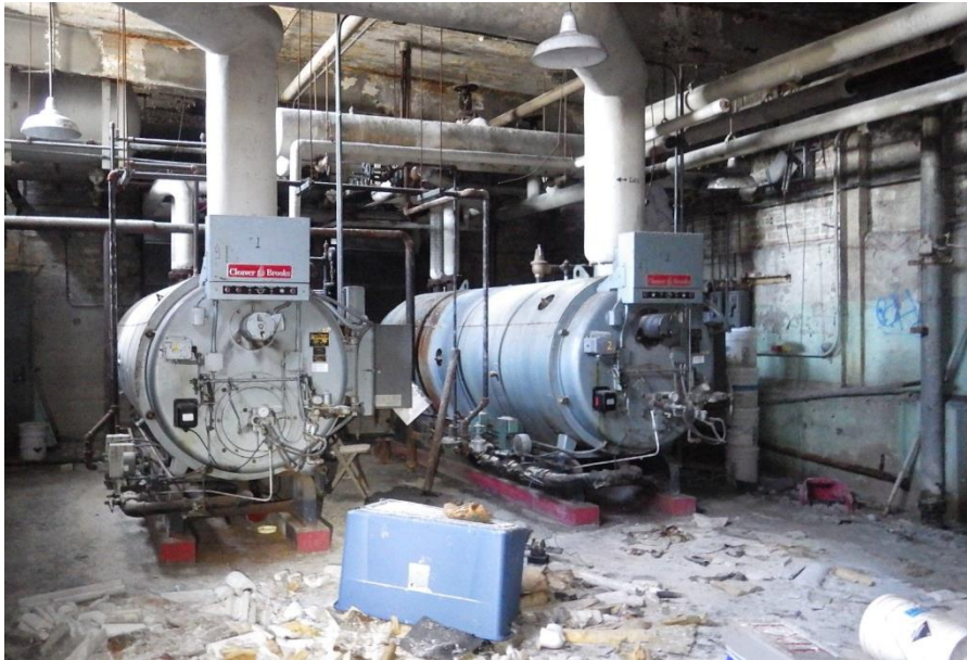
Mechanical Room, 2001 West Vliet Street