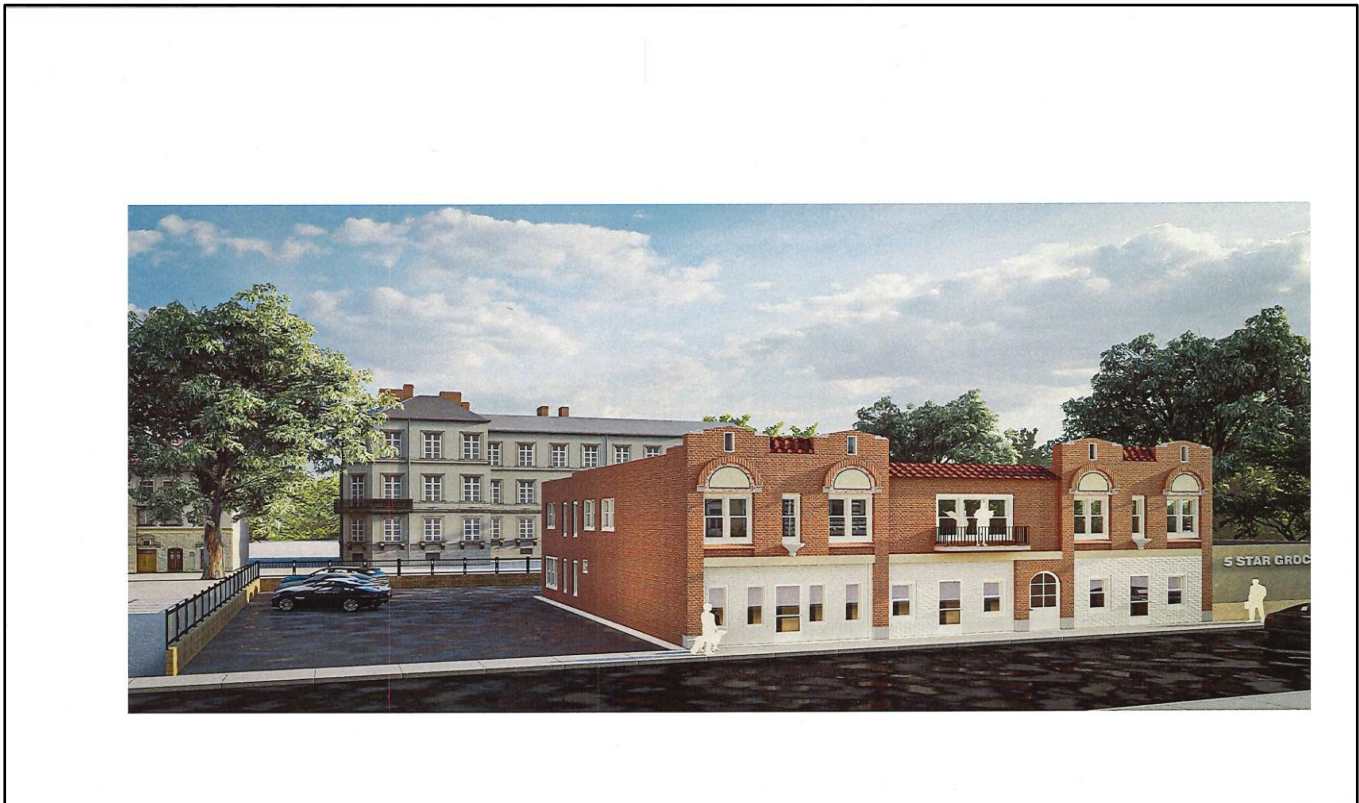
BUYER'S CONCEPTUAL RENDERING OF 5008-14 AND 5016-18 WEST CENTER STREET