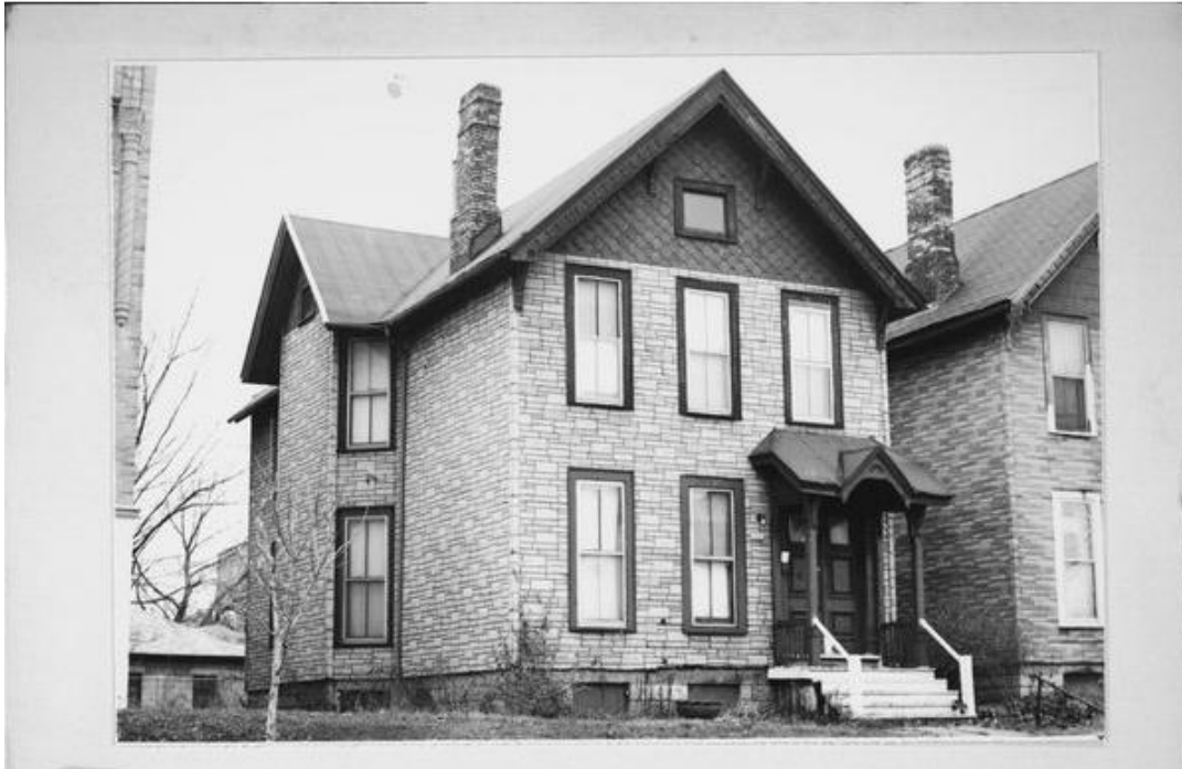
Survey Photograph indicating the loss of the original gable ornament