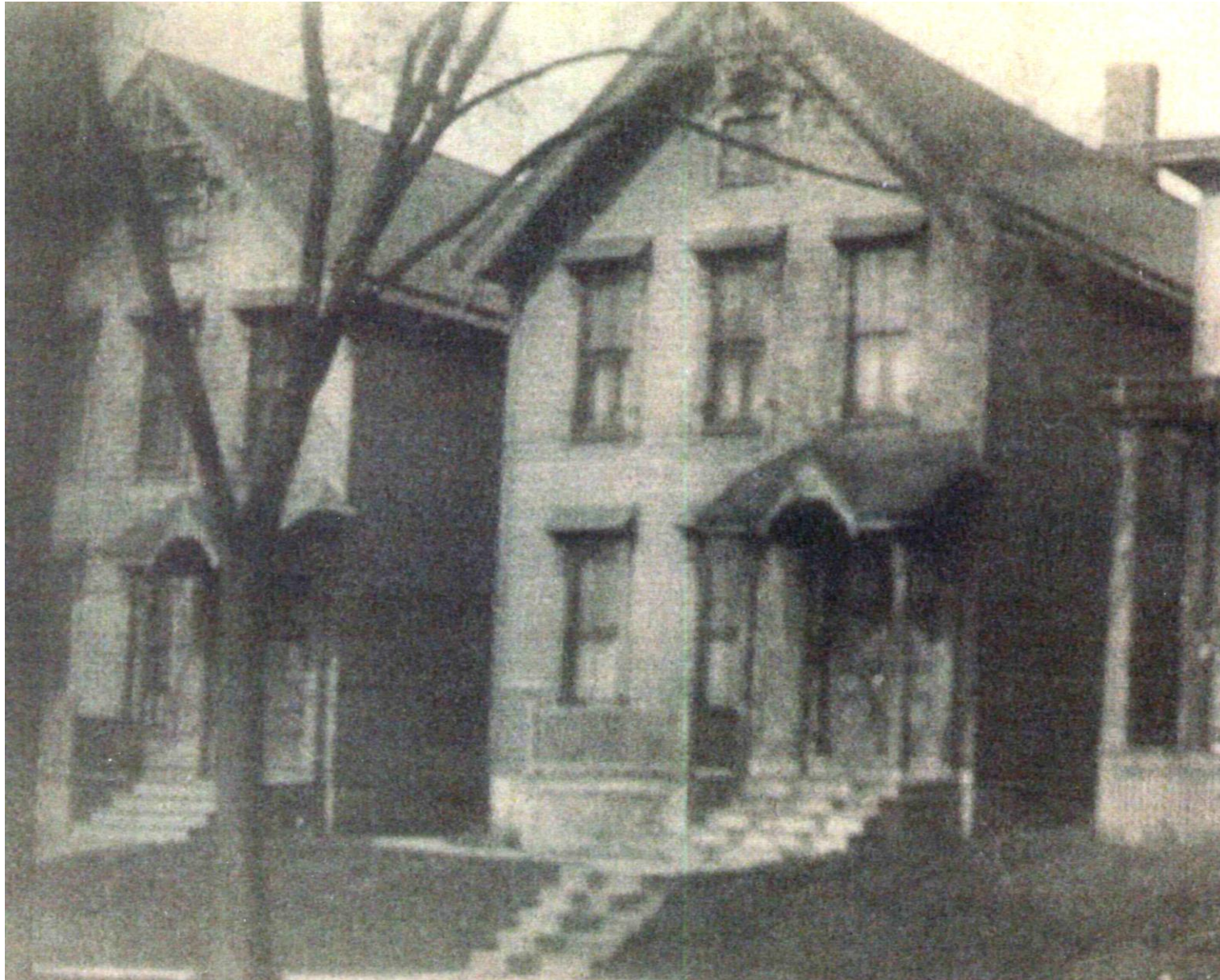
1920s photo showing twin houses with original gable ornaments