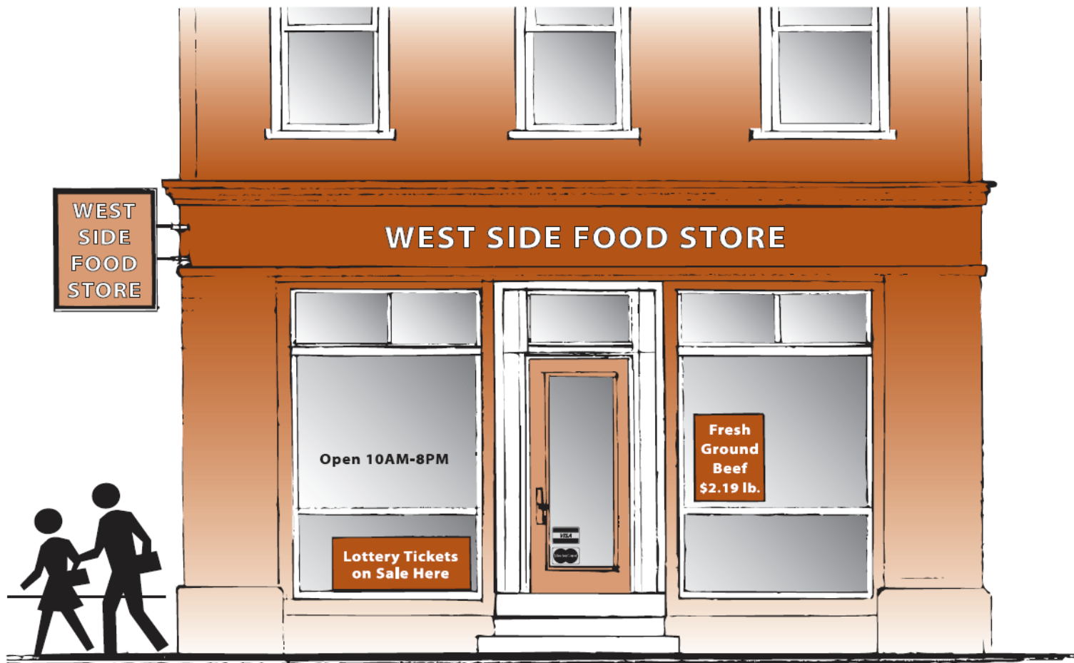
Minimal signage gives customers an impression of organization and provides clear messaging.