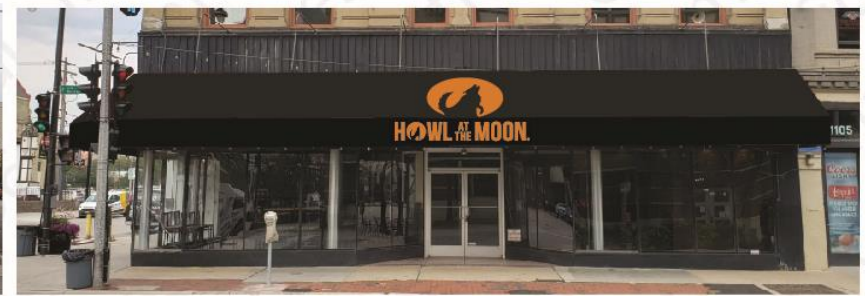
Old World 3rd St View

Location: 1103 Old World 3rd St, Milw WI