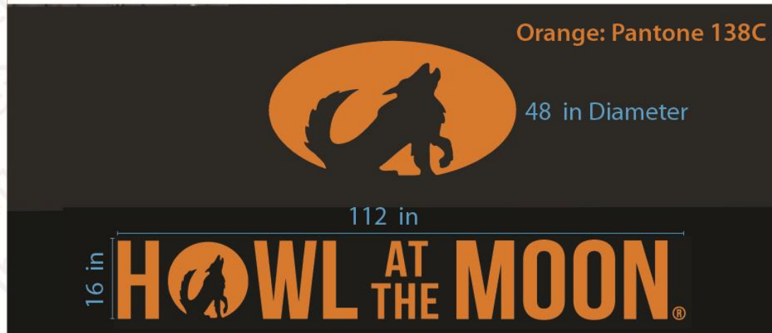
Awning Front View

Location: 1103 Old World 3rd St, Milw WI