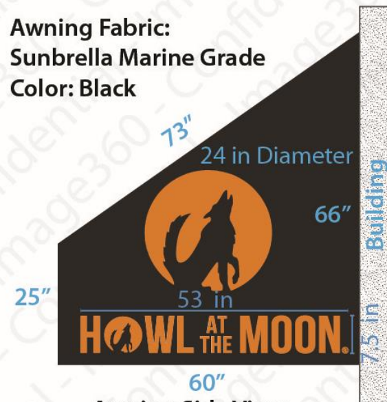
Awning Side View

Awning Fabric: Sunbrella Marine Grade Color: Black