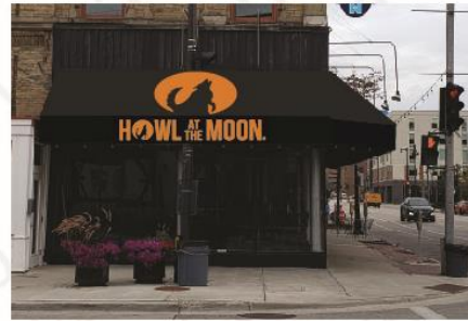
Highland Ave View

CUSTOMER: Howl at the Moon ORDER #: 46298 PROJECT: Awning Graphics PROOF DATE: 11/09/2021 SCALE: NTS COLORS: Fabric: Black Sunbrella Orange: Pantone 138C