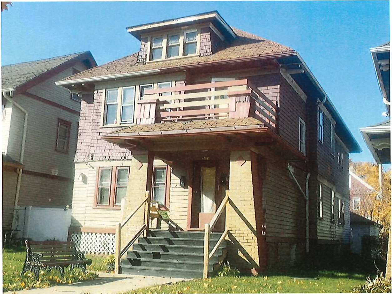
3071-73 North 39 th Street