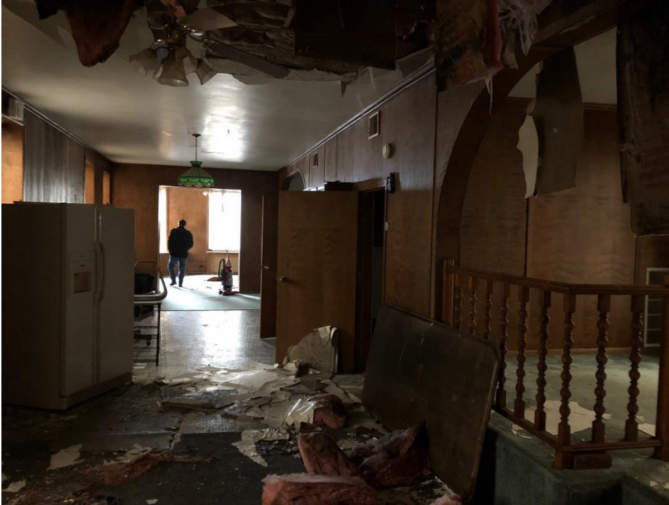
Second Floor (original proprietor's residence) looking East