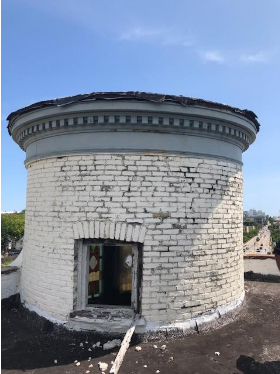
View past Turret from roof looking East towards Lake down North Avenue