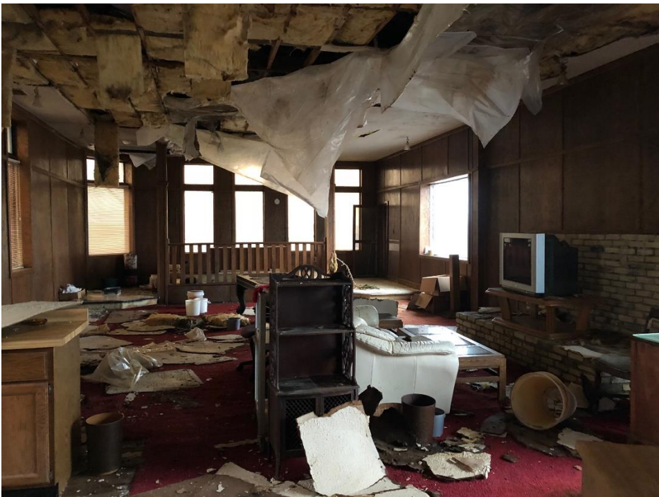
Third Floor (original meeting Hall) looking East