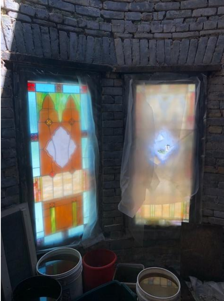
Stained Glass Windows in Turret