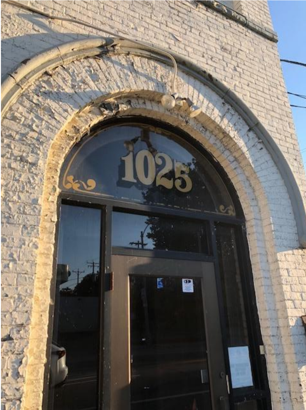
North Avenue Entrance to stairs and Upper floors