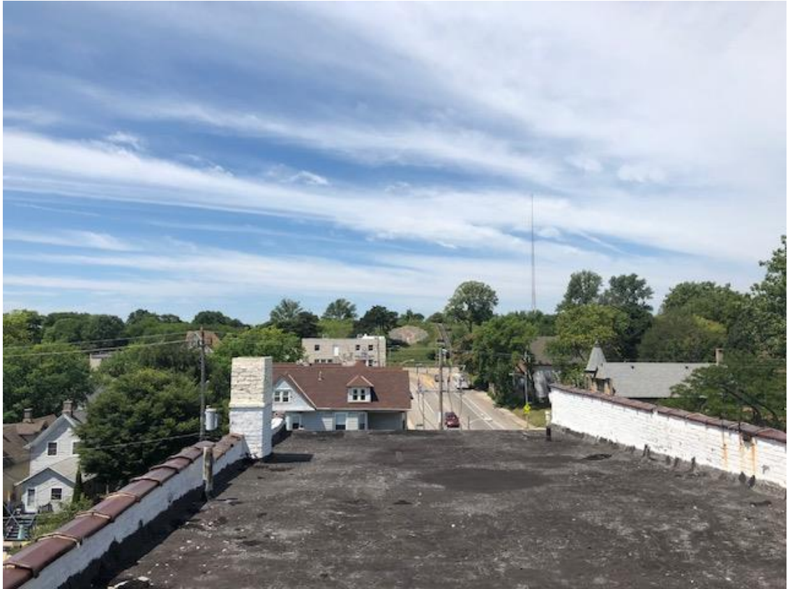
View looking West down North Avenue to Reservoir Park Hill and Floral design