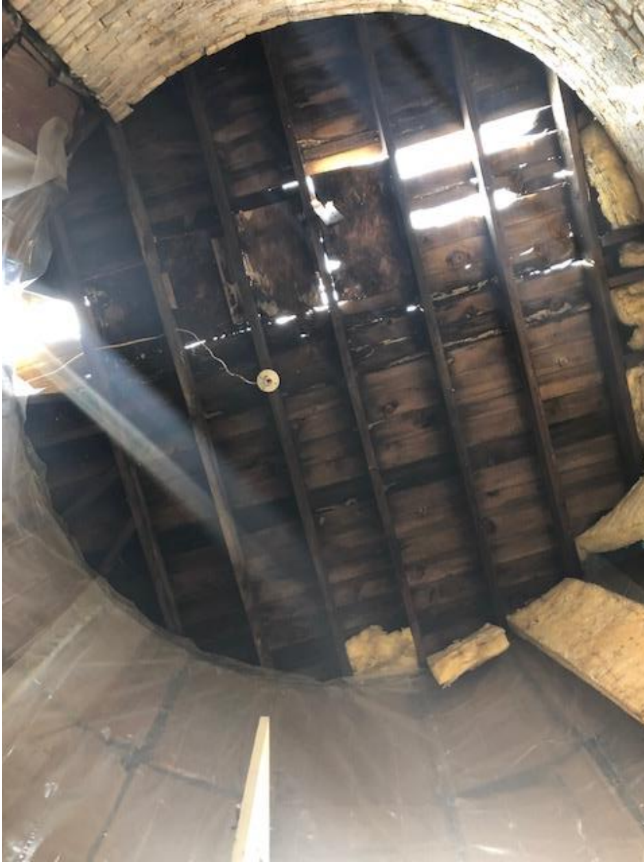
Hole in roof of Turret