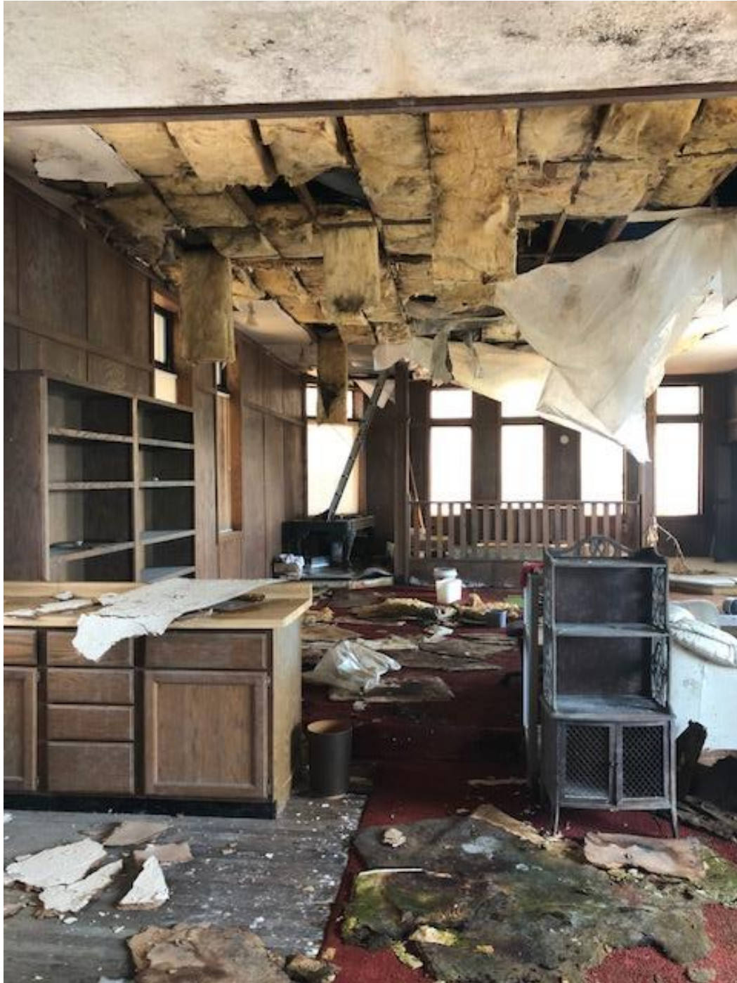
3 rd Floor (Original Meeting Hall) Looking East