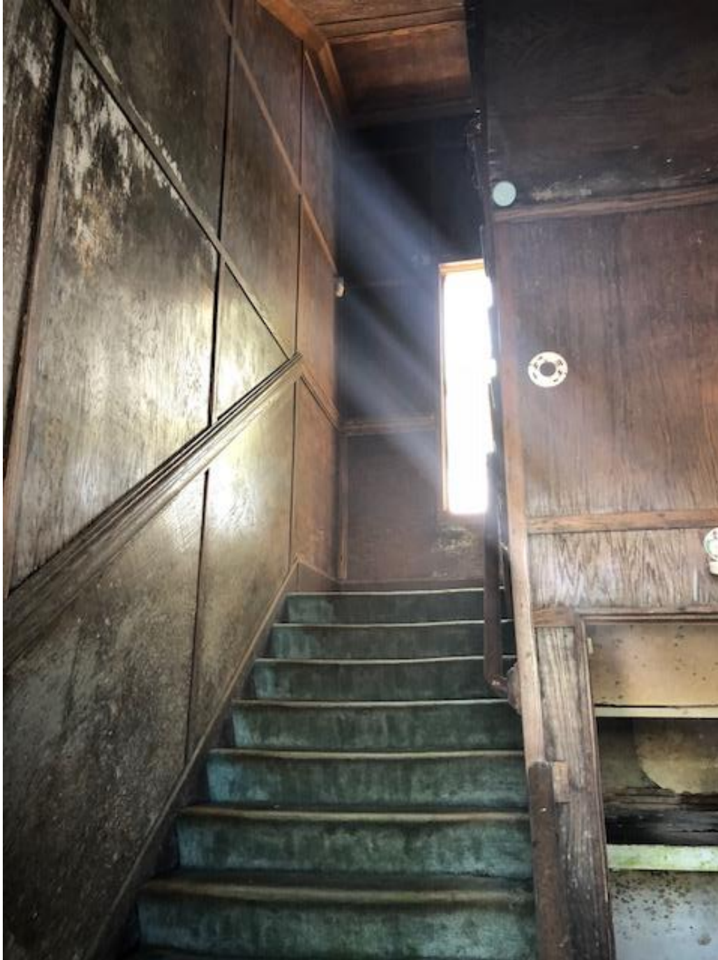
Staircase looking up to 2 nd Floor