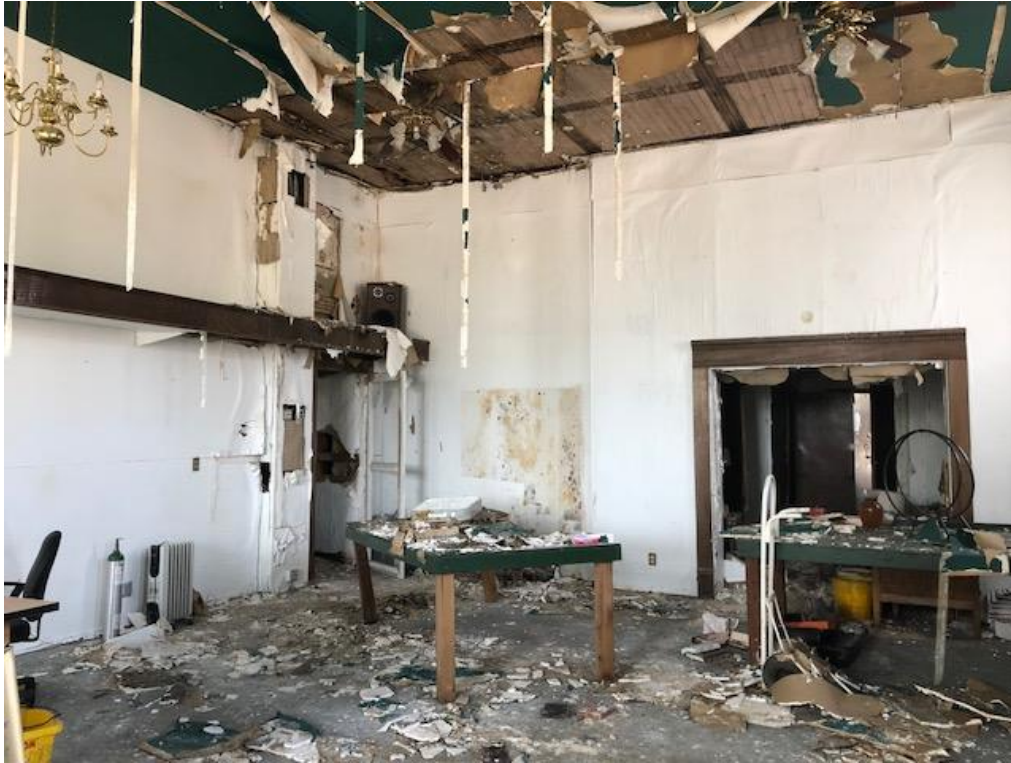
Interior 1 st floor Northern Space (original tavern space) looking West