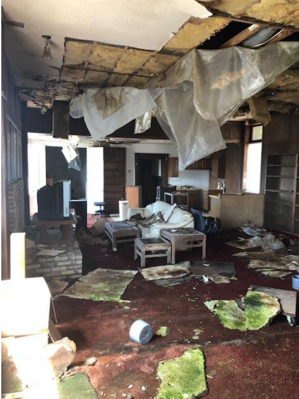
3 rd Floor (Original Meeting Hall) looking West