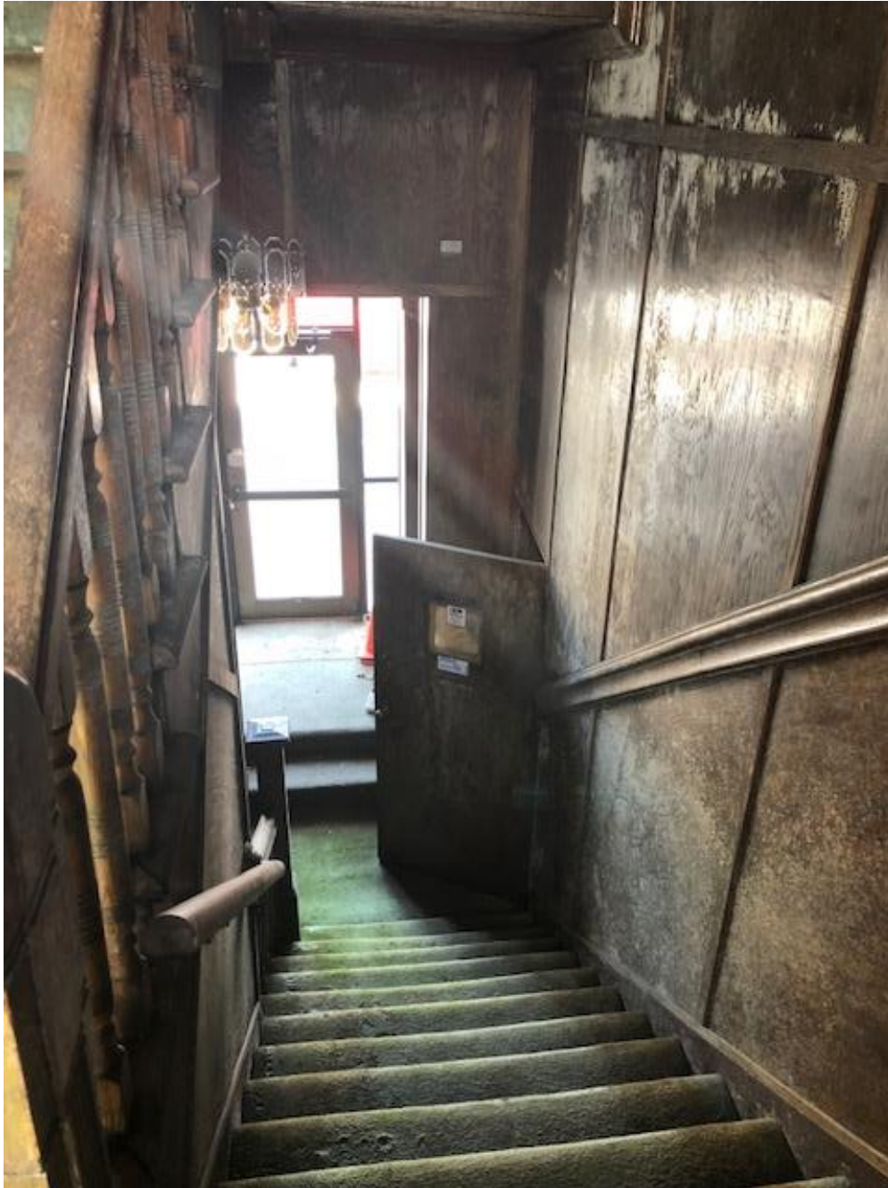
Staircase looking down from landing