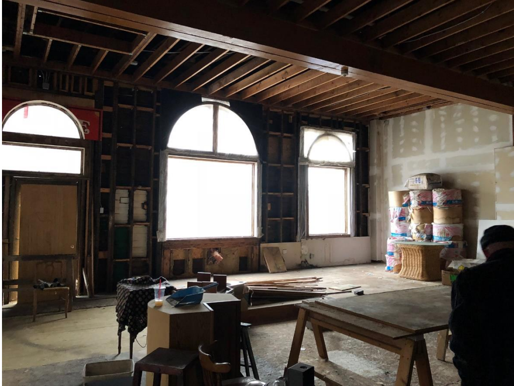
Interior 1 st floor Southern Space (original bowling alley space) looking East