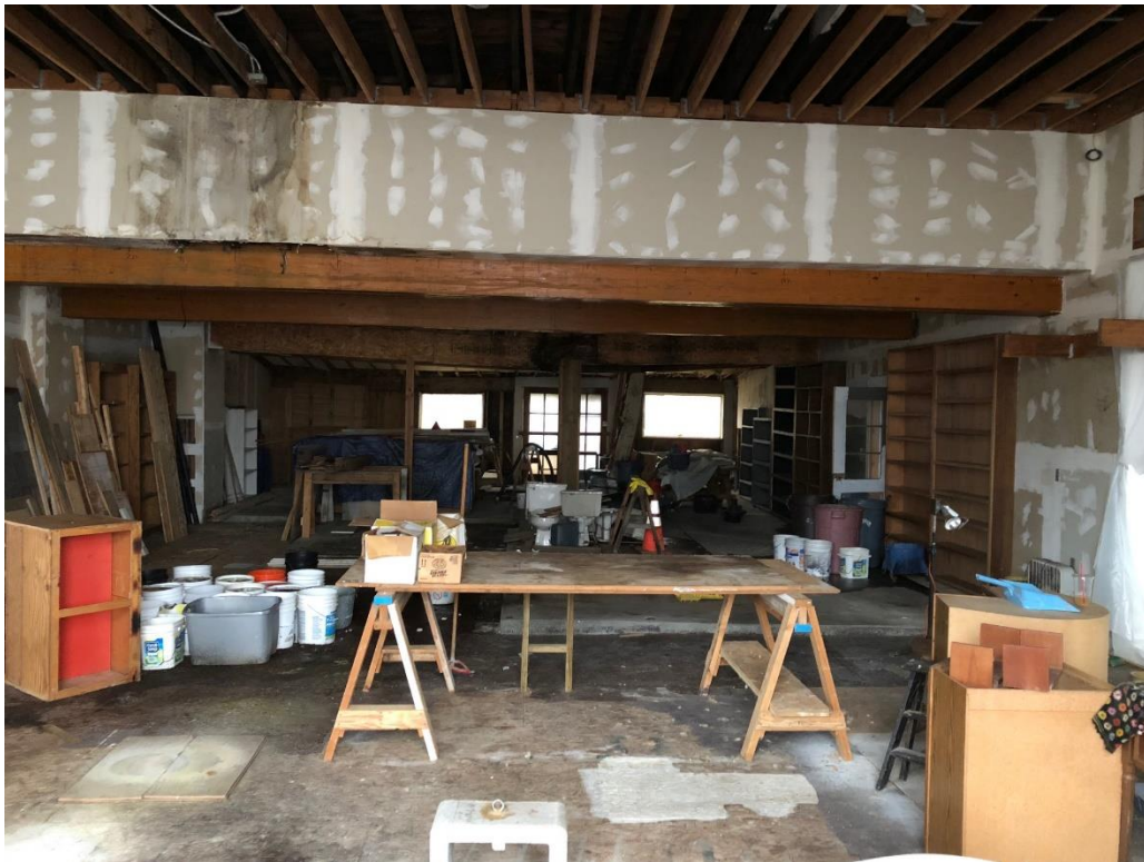
Interior 1 st floor Southern Space (original bowling alley space) looking West