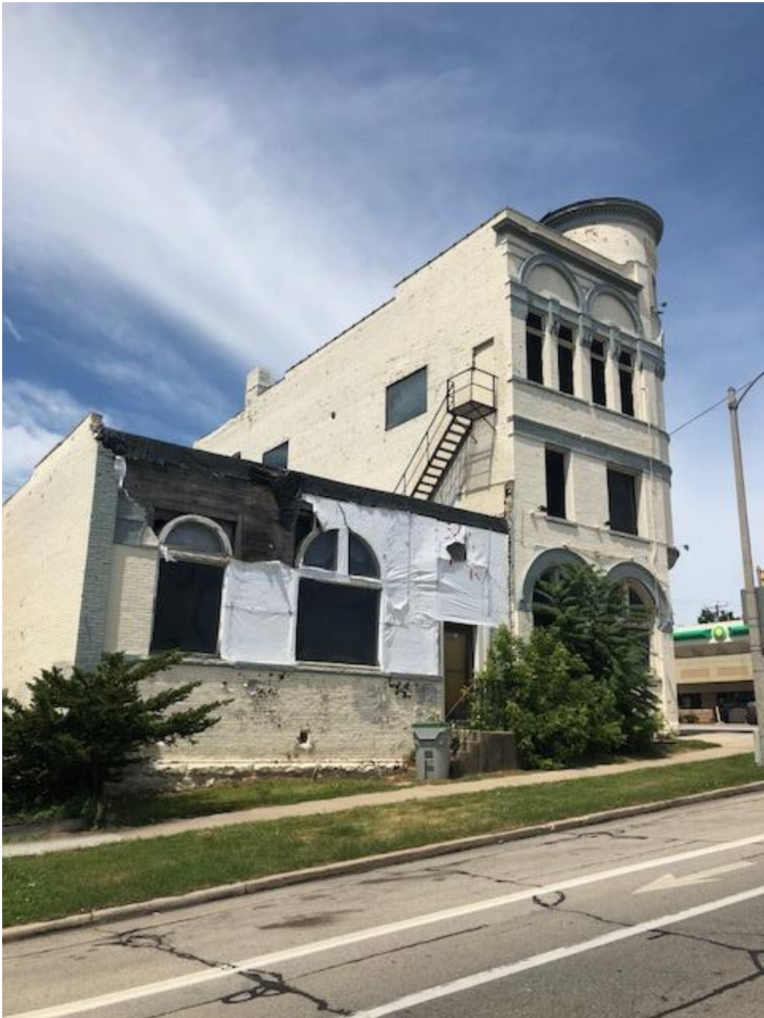
Partial South and East Elevations